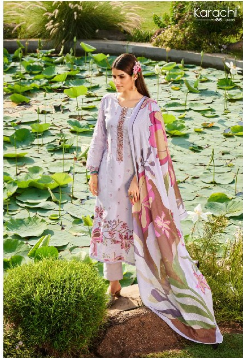
THE ELEGANT ALTERNATIVE 1605-