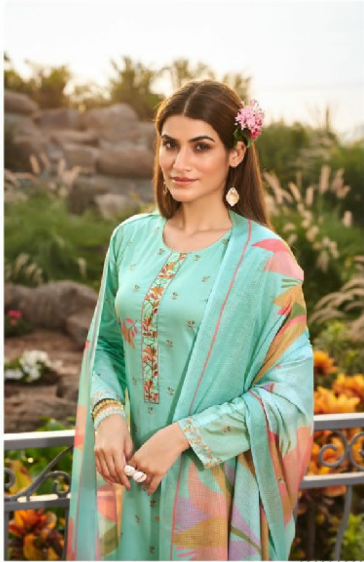
THE ESSENCE OF GREAT 1691-