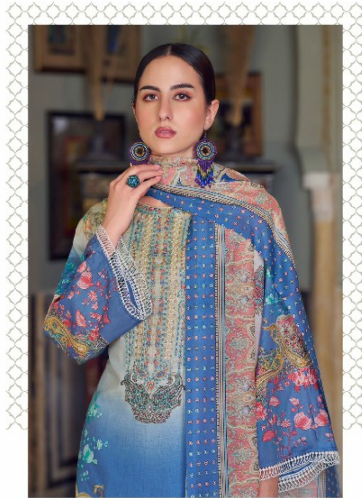
Classic styles with luxurious soft fabrics are highlighted by refined and feminine details