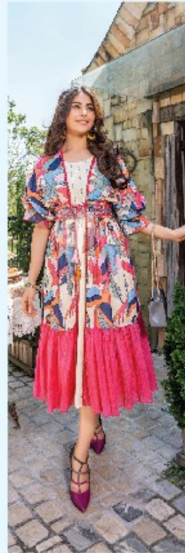
DREAMY 100% 3051