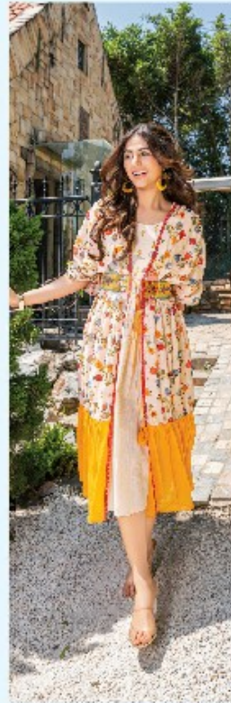
DREAMY 100% 3052