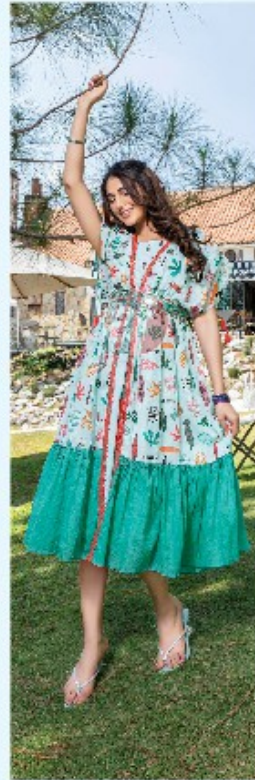
DREAMY 100% 3053