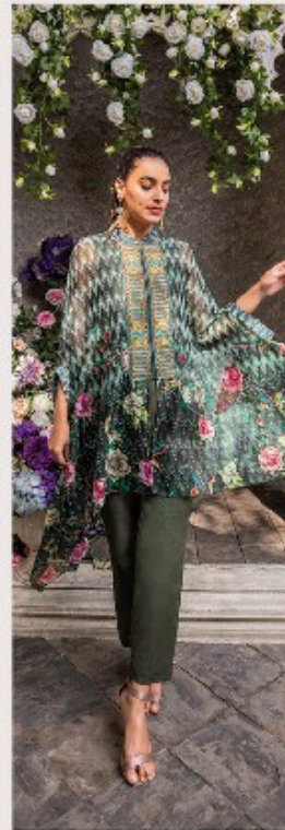
CAPE Style 5002