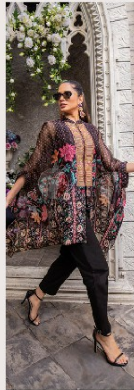
CAPE Style 5001