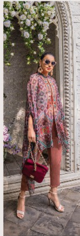
CAPE Style 5005