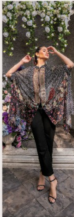
CAPE Style 5004