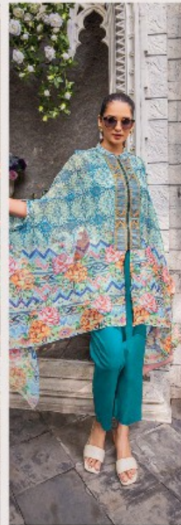
CAPE Style 5003