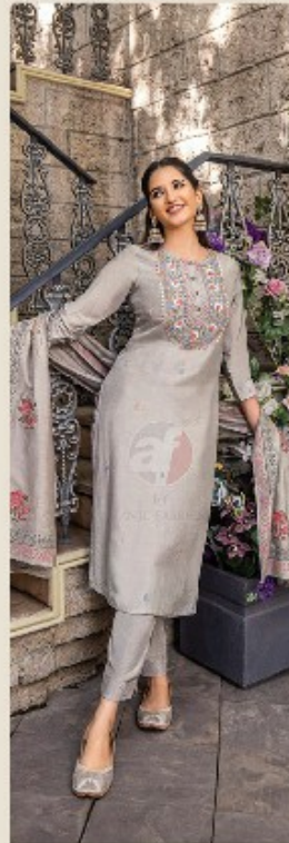
GOLDEN 3634 Handing