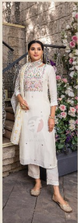
GOLDEN 3633 Ready