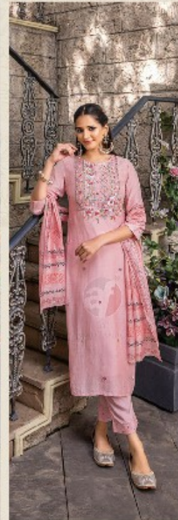
GOLDEN 3636 Handing