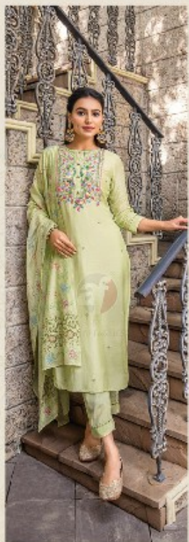
GOLDEN 3632 Ready