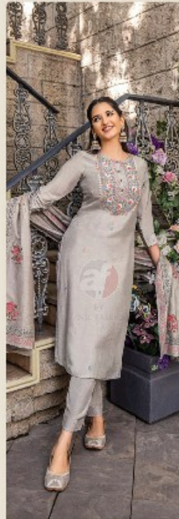
GOLDEN 3634 Handing