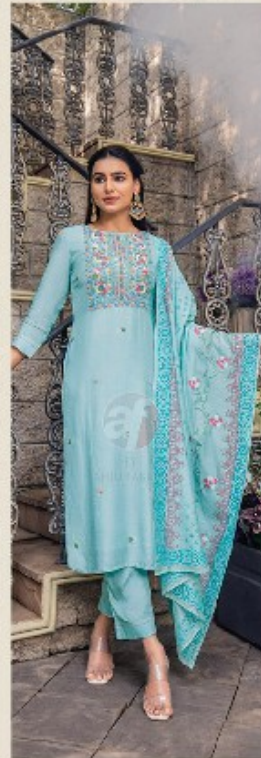
GOLDEN 3635 Handing