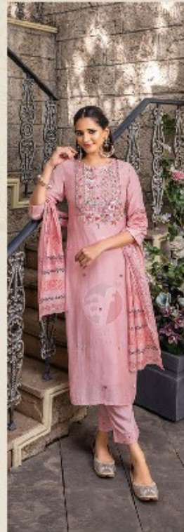
GOLDEN 3636 Handing