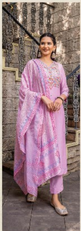
GOLDEN 3631 Ready