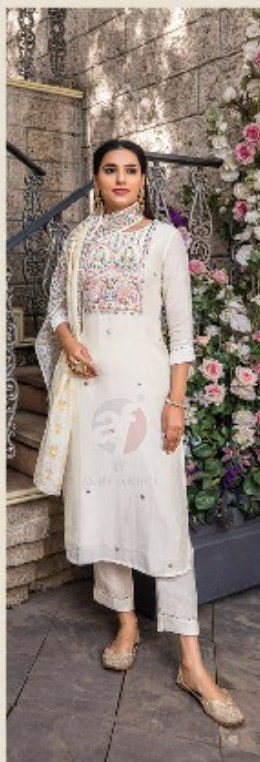
GOLDEN 3633 Ready