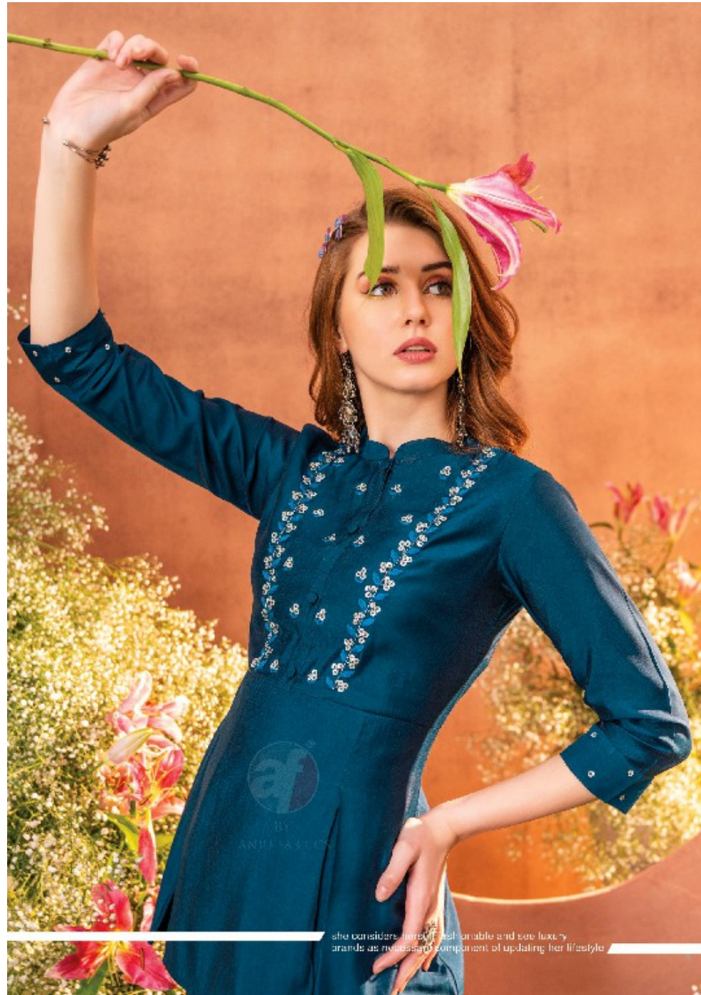
she considers herself fashionable and sees luxury brands as necessary component of updating her lifestyle