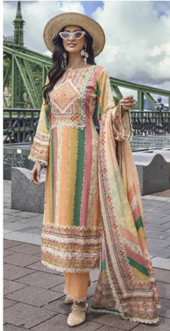
The designs were multi utility & we could see a few outfits that we could wear up with other everyday