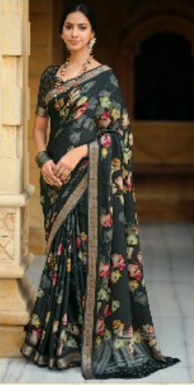
DN /// 1002