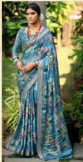
DN // 1009