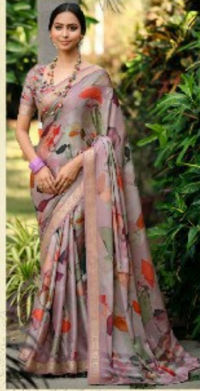
DN /// 1003