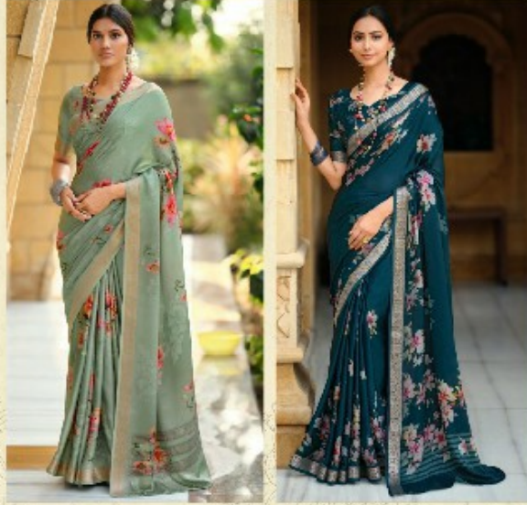
DN // 1004