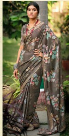
DN // 1010