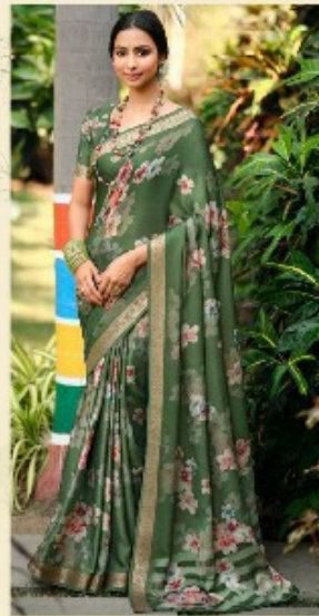
DN // 1008