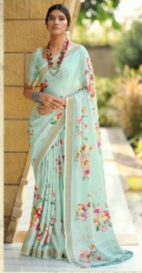
DN /// 1001