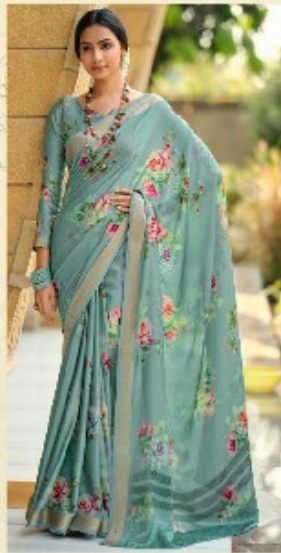
DN /// 1007