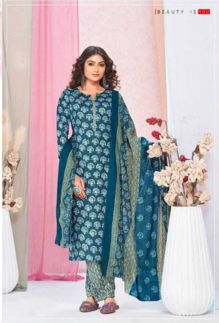
THE COLLECTION WAS A PERFECT BLEND OF INDIAN SILHOUETTES & CONTEMPORARY STYLE NO.3003