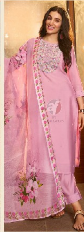
Chandani VOL-3 D.no.3733