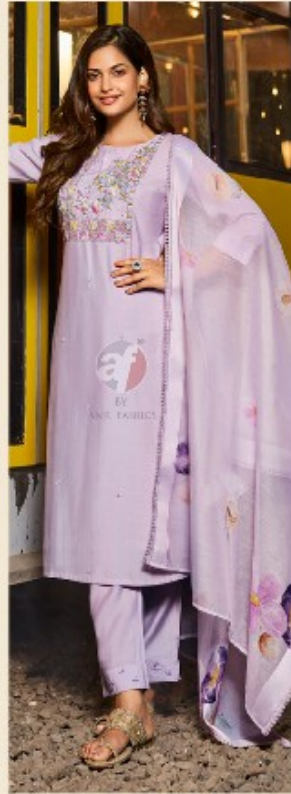
Chandani VOL-3 D.no.3735