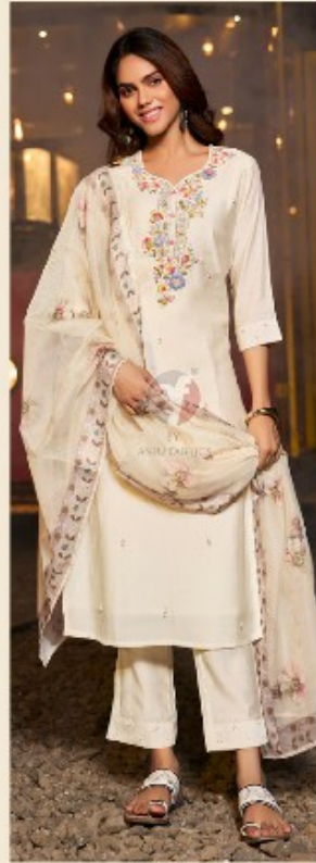
Chandani VOL-3 D.no.3734