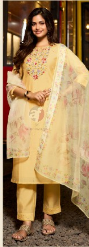
Chandani VOL-3 D.no.3732