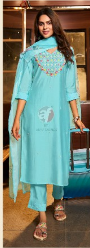
Chandani VOL-3 D.no.3731