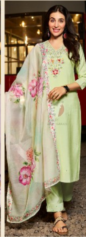
Chandani VOL-3 D.no.3736