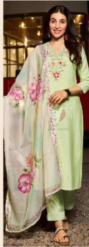
Chandani VOL-3 D.no.3736