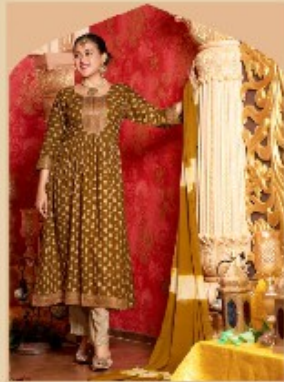
◀ 007 ▶