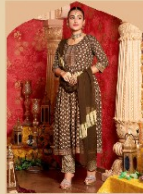
◀ 005 ▶