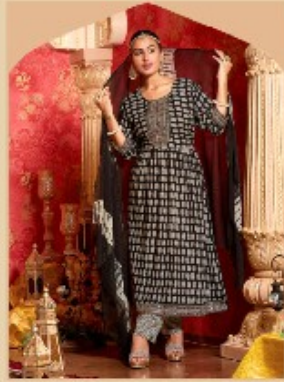
◀ 002 ▶