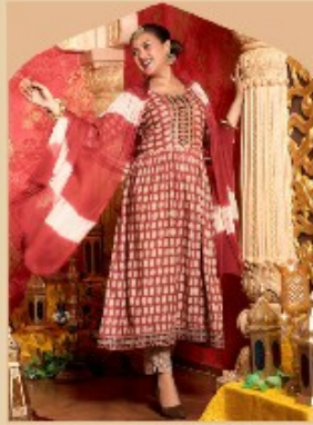
◀ 001 ▶