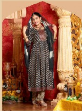
◀ 006 ▶