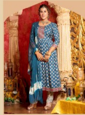
◀ 003 ▶