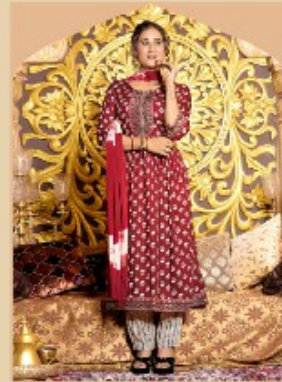
◀ 008 ▶