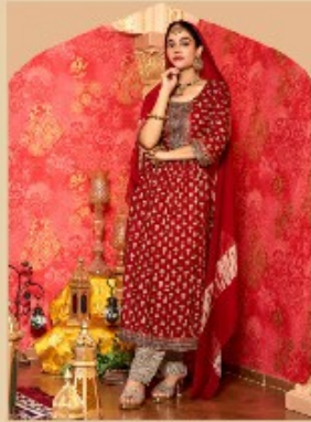
◀ 004 ▶