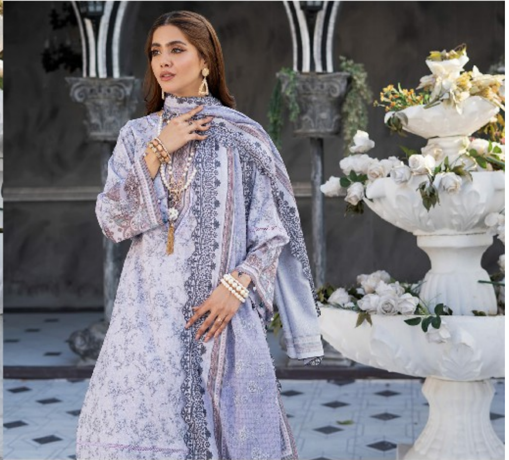
The Vibrant Chunri Lawn Collection, inspired by cultural prints and the effortless fabric that makes it look inherently beautiful.