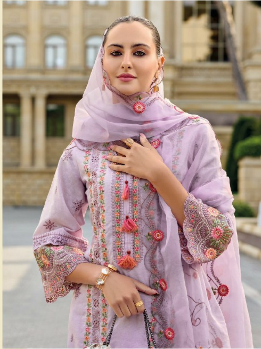
Dressing well is a form of good manners