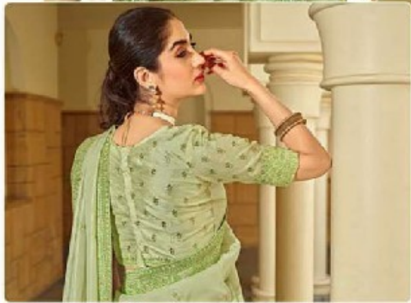
Embroidered with beady, woven silk threads, each saree tells a tale of fabrics so gorgeous.