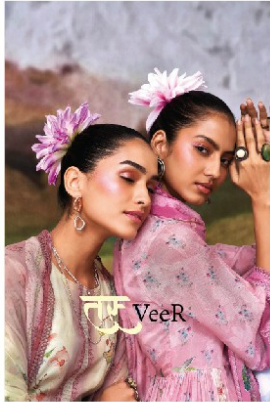
A group photograph of two models wearing traditional Indian attire, including pink and white saris with floral patterns. They are adorned with large pink flowers in their hair and jewelry. The text 'VeeR' is overlaid on the image in a stylized font.