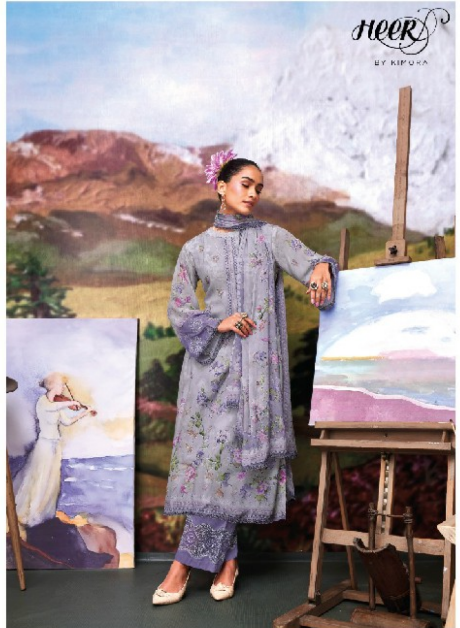
A woman's elegant and artistic expression of style is reflected in the design, construction and styling of her dress.