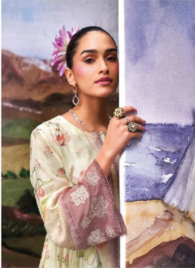
A great photograph is one that fully expresses what one feels in the deepest sense about what is being photographed.