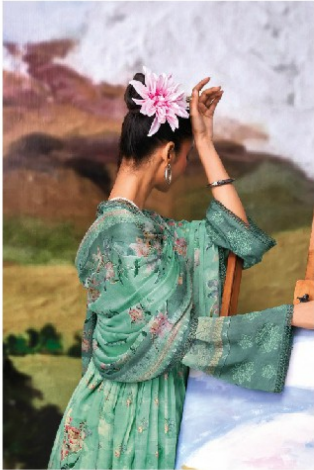
A good photograph is one that fully represents what one wishes the subject to be when it is being photographed.