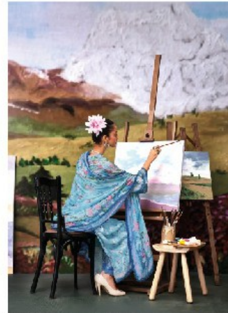
A great photograph is one that fully expresses what one feels in the deepest sense, about what is being photographed.