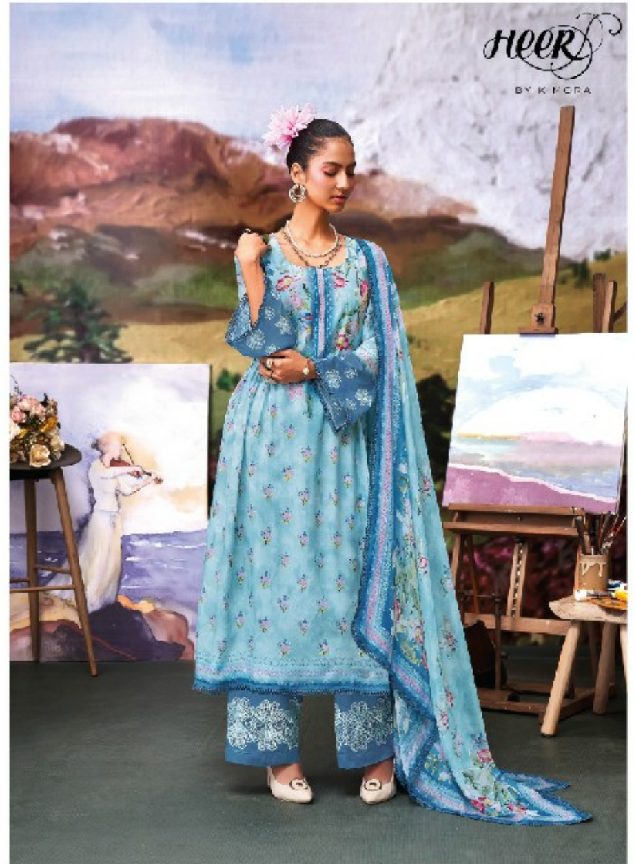
A good photograph is one that fully expresses what the subject is and what it is like to be there.