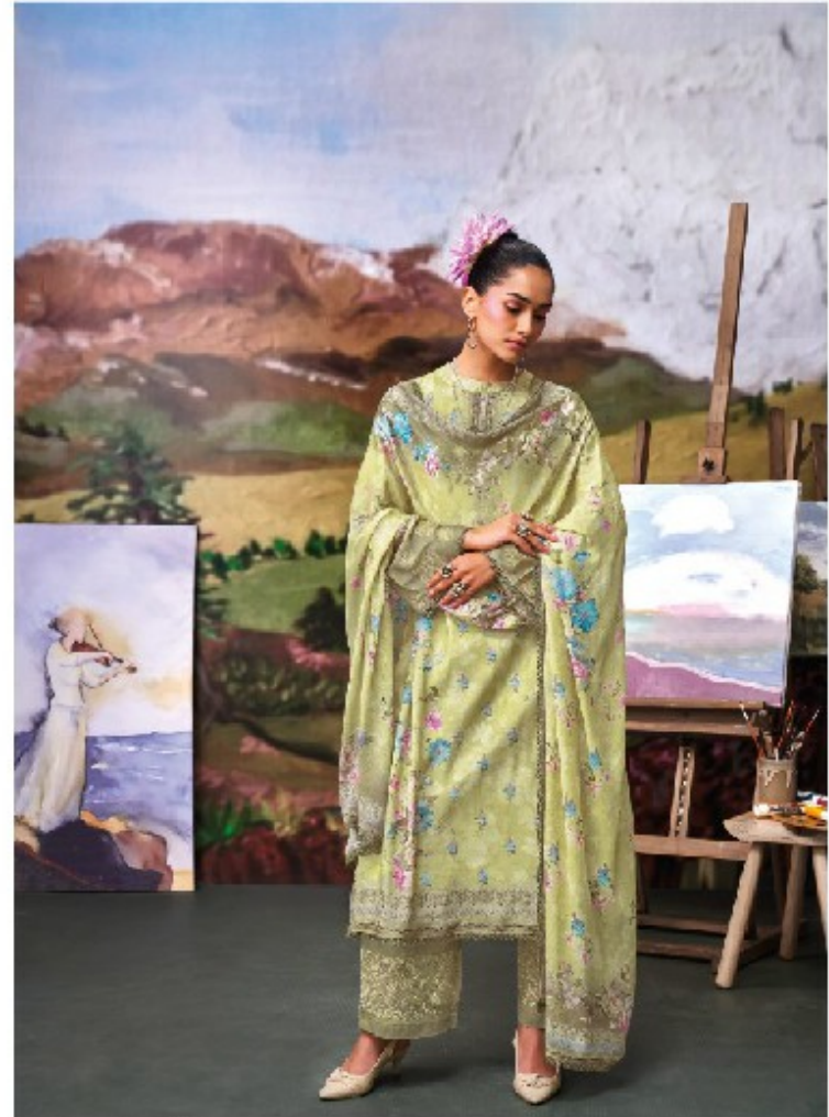
A green floral ensemble in the style of the 1950s. The outfit is made of a light green fabric with a delicate floral pattern. The ensemble includes a long-sleeved tunic and matching trousers. The outfit is accessorized with a large pink flower in the hair, a necklace, and several rings.