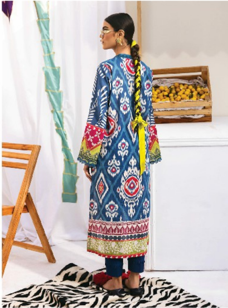
1 Pc NGL-01

GRACE OR BEAUTY OR HUMOR, AS WHATEVER SHE MAY FIND BUT AN OFFICE IS NOT A PLACE TO BE, LEAVING THE MESSY- OF JUST LIVES TO THE BEST. BEAUTY BEGINS THE MOMENT YOU DECIDE TO BE YOURSELF. THIS ENSEMBLE IS BALANCED IN A COMPOSITION THAT MIXES THE QUALITY OF MULTIPLE CLIENTS AND ALLOW YOUR BEST SIDE TO COME FORTH.