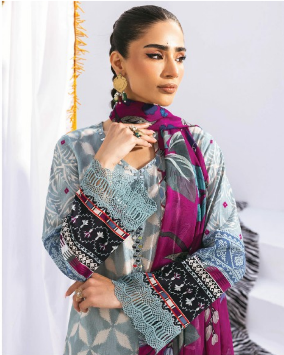
Entire up in abadi, color of both color. No gift present you a discount range of 2 piece to 3 piece instead suggested from call or in with a half lot of packing fee!