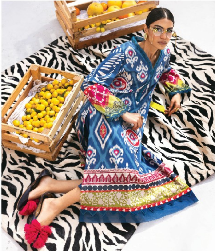
Guzzle up in citrus, bring it back to zero. We like presents, you'll love our range of 2 piece & 3 piece printed sustainable linen collections with a little bit of sparkling fuel!