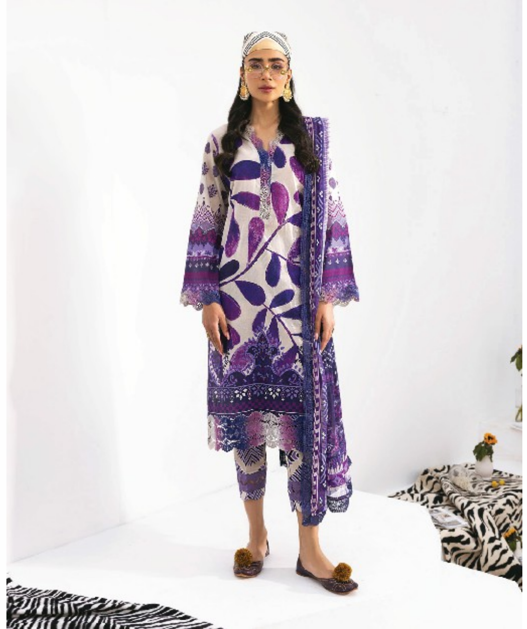
NGL-03 3 pc

THE SELECTION IS INSPIRED BY THE BEST OF THE GREAT GARDENS OF THE WORLD. GET THE BEST OF THE GREAT GARDENS OF THE WORLD. STAY EACH THE SEASONAL COLOURS FEATURED IN THIS COLLECTION AS ELEGANT WITH HIGH IMPACT THIS SEASON. GET THE BEST OF THE GREAT GARDENS OF THE WORLD. THE SELECTION IS INSPIRED BY THE BEST OF THE GREAT GARDENS OF THE WORLD.