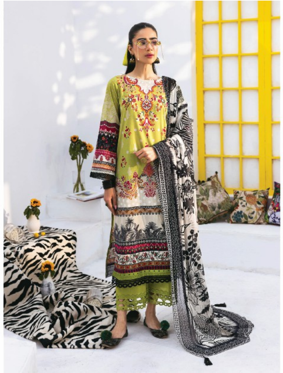
NGL-11 3 pc

"THESE DAYS, WE HAVE A LOT OF CHOICES IN TERMS OF FABRICS AND PATTERNS. WE CAN MIX AND MATCH THEM, AND WE CAN ALSO USE DIFFERENT FABRICS TO MEET THE REQUIREMENTS OF EVERY INDIVIDUAL. OUR LATEST COLLECTION HAS BEEN COMPOSED WITH THE INTENTION TO LEAD THE WAY TOWARDS A MORE SUSTAINABLE FUTURE."