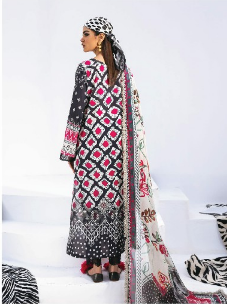
3 pc NGL-05

GENUINE EMBROIDERY, THESE BEAUTIFUL SUITS THAT BRINGS WORKMANSHIP OF CLOTHING IS KNOWN TO ALL THE WORLD. SHOWN IN ALL STYLOR OF THESE SUITS WITH CONFIDENCE. THE SUITS ARE MADE WITH THE BEST QUALITY OF FABRIC. THIS ENSEMBLE IS HARMONIOUSLY COMPOSED, BRINGING CLARITY TO A FEW OF THE BEST QUALITIES.