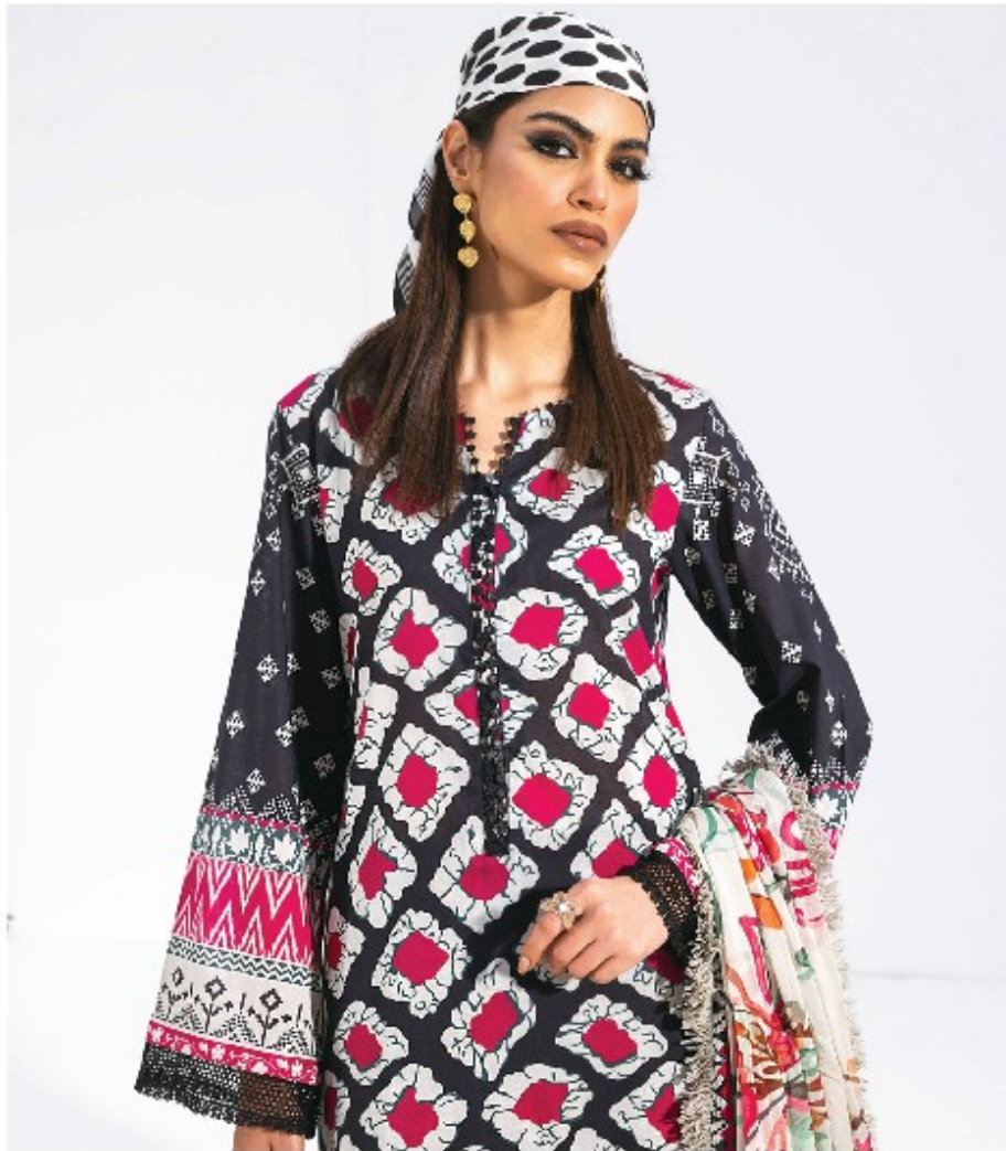
Gettle up in class, bring it back - here - 3 girls present you a complete range of 3 piece & 2 piece printed sustainable lean collection with a little bit of sparkling fun!