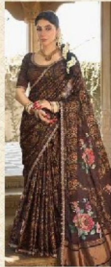
43707 Fabric - Gajji Silk