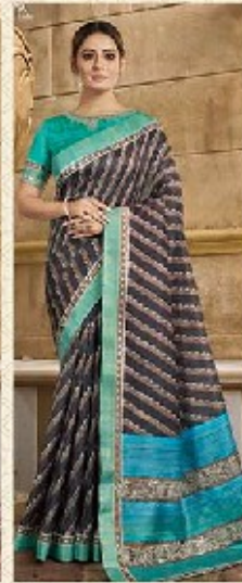
43715 Fabric - Gajji Silk