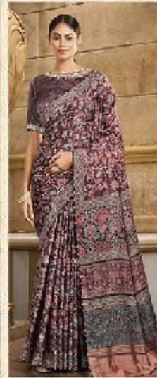
43714 Fabric - Gajji Silk