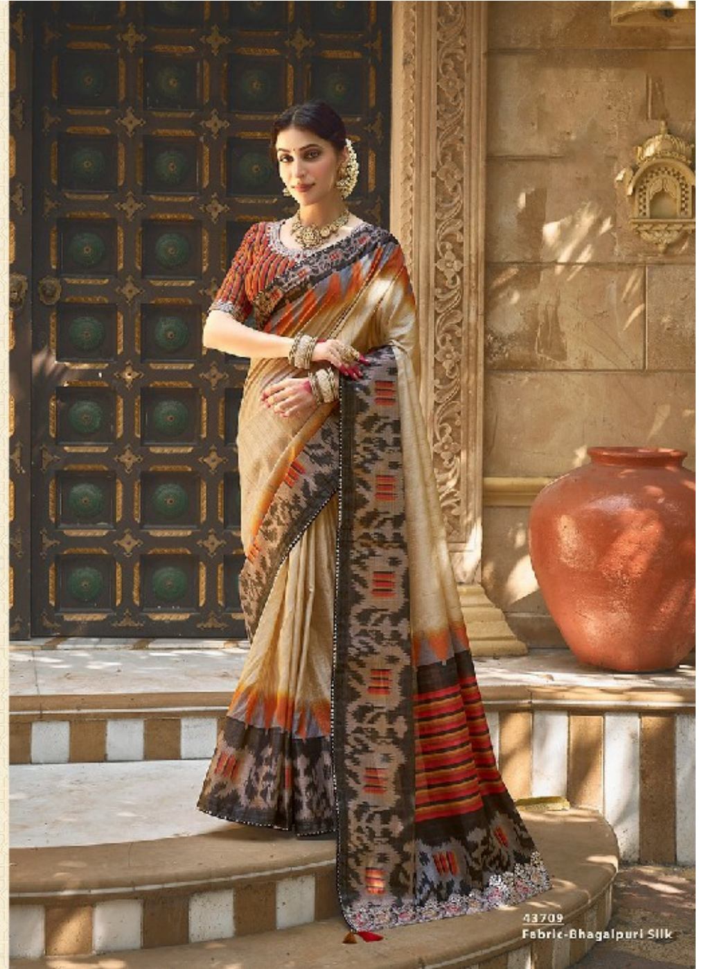
43709 Fabric-Bhagalpuri Silk