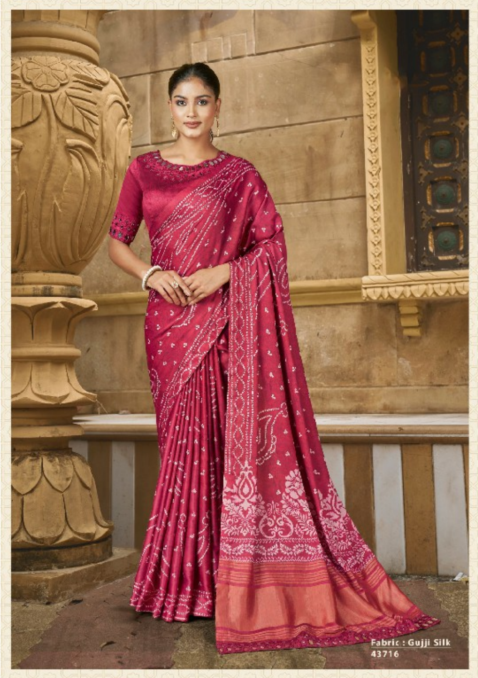
Fabric : Gujji Silk 43716