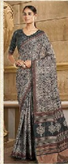
43713 Fabric - Gajji Silk