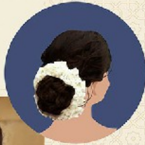
Weaving stories of womanhood with the beauty of gajra