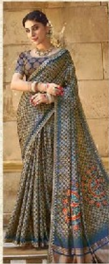
43705 Fabric - Gajji Silk