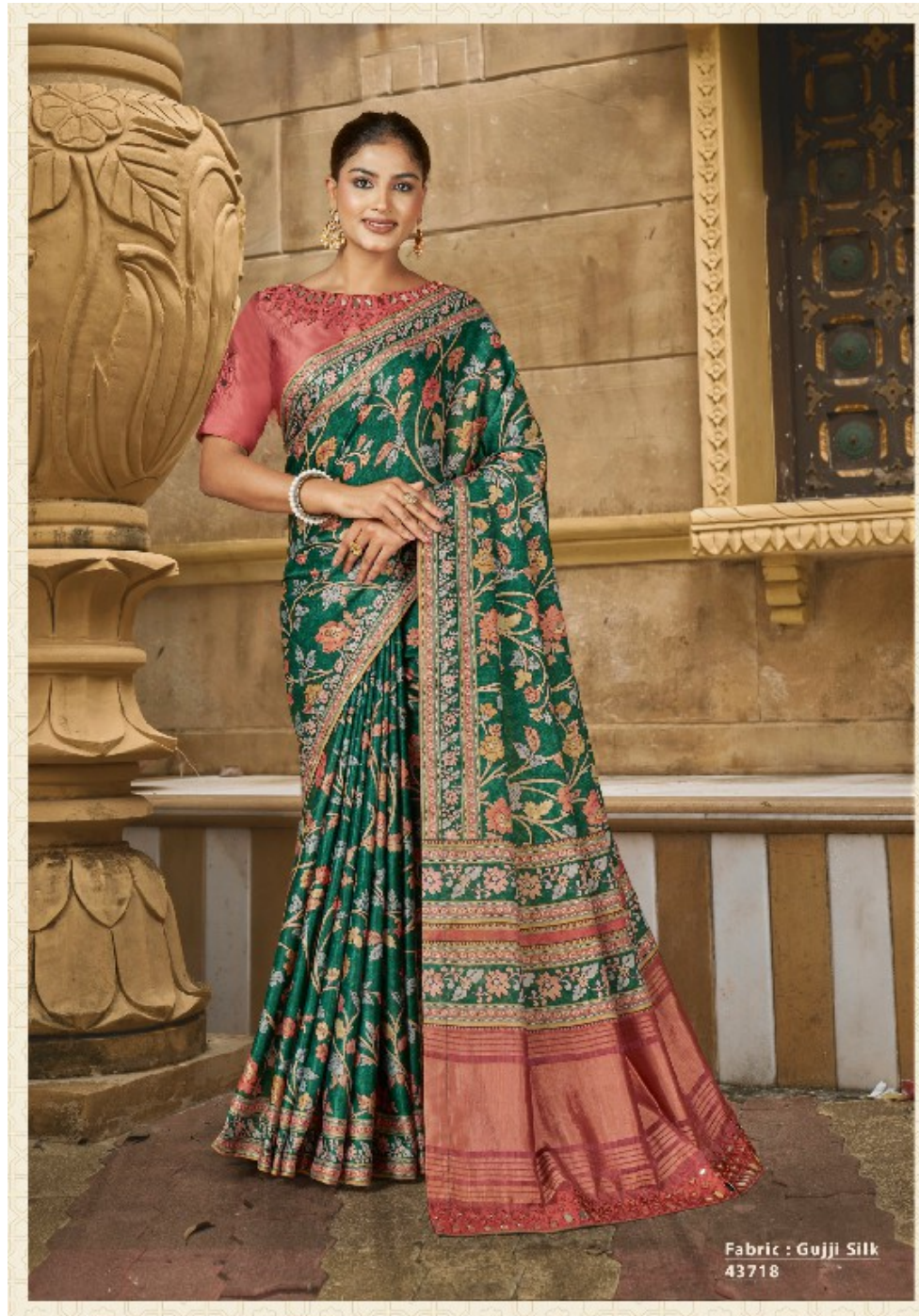
Fabric : Gujji Silk 43718