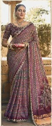
43704 Fabric - Gajji Silk