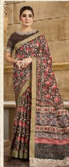
43717 Fabric - Gajji Silk