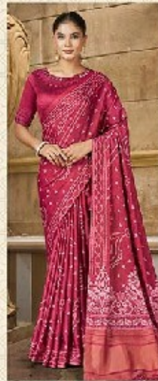
43716 Fabric - Gajji Silk