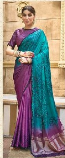
43710 Fabric - Gajji Silk