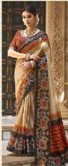
43709 Fabric - Bhagalpuri Silk