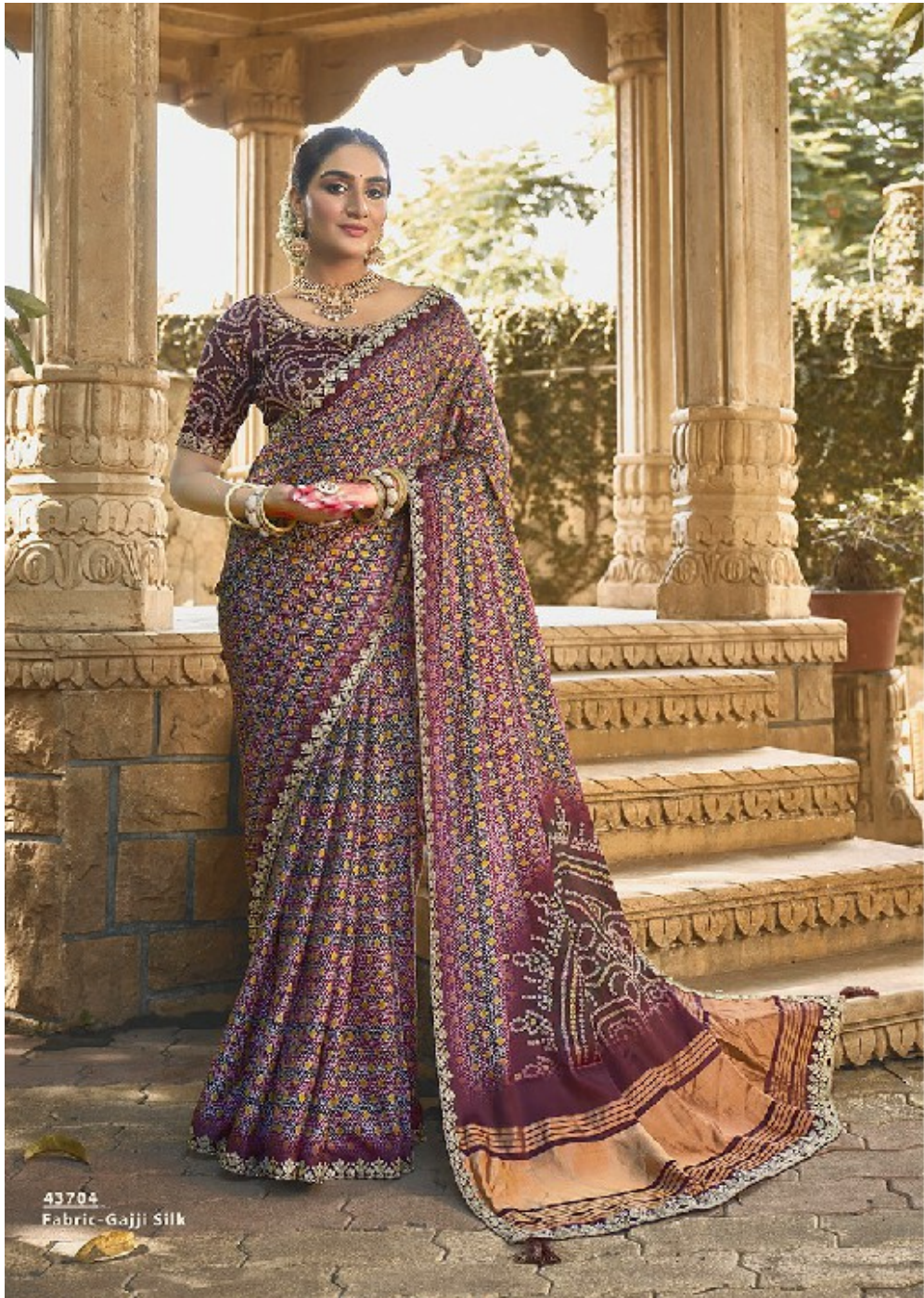
43704 Fabric-Gajji Silk