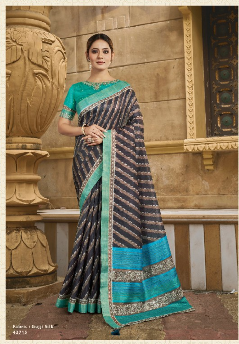
Fabric : Gujji Silk 43715