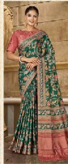
43718 Fabric - Gajji Silk