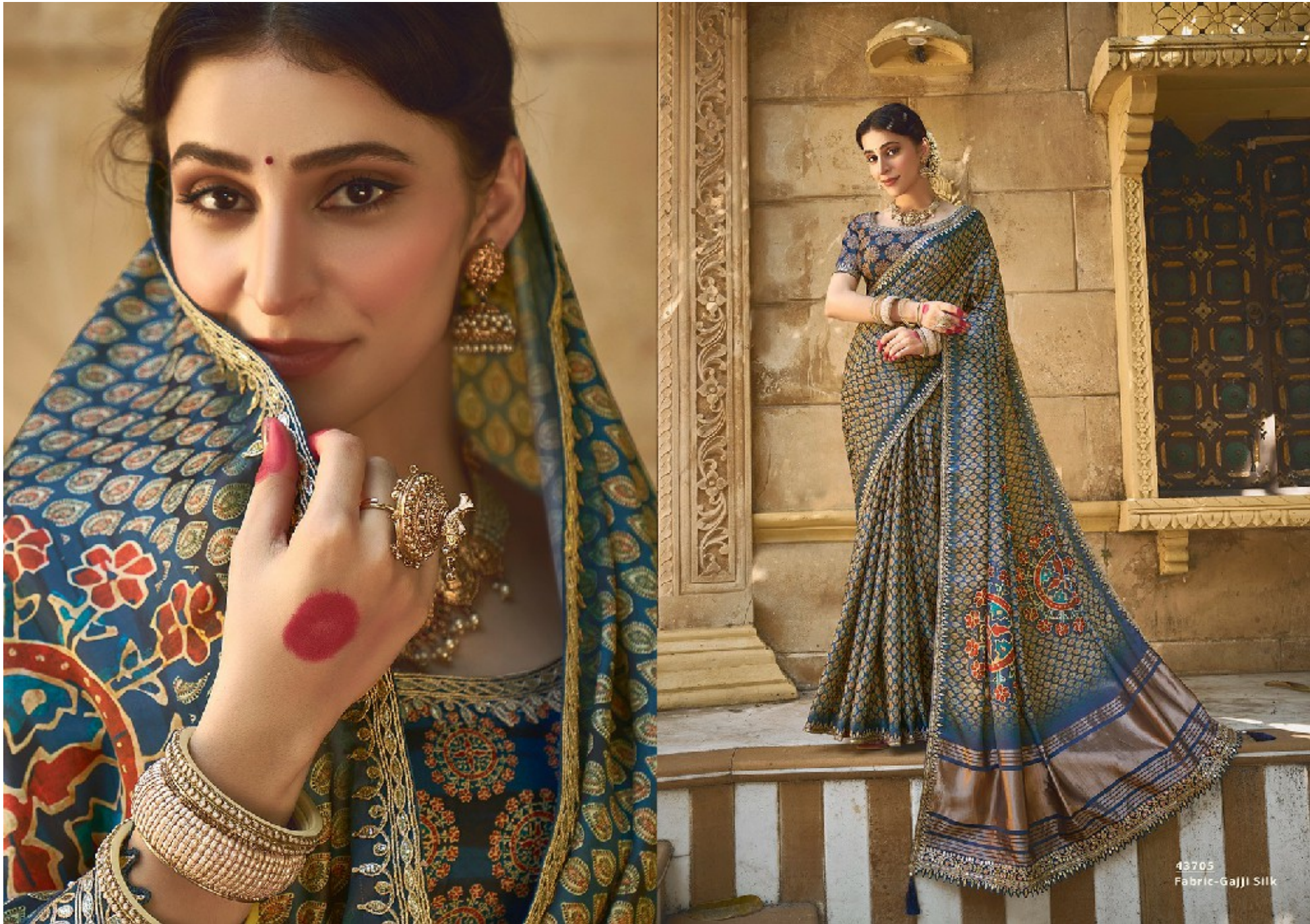
43705 Fabric-Gajji Silk