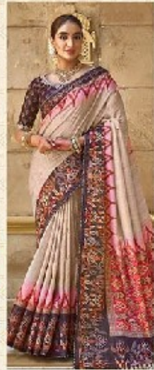
43706 Fabric - Bhagalpuri silk