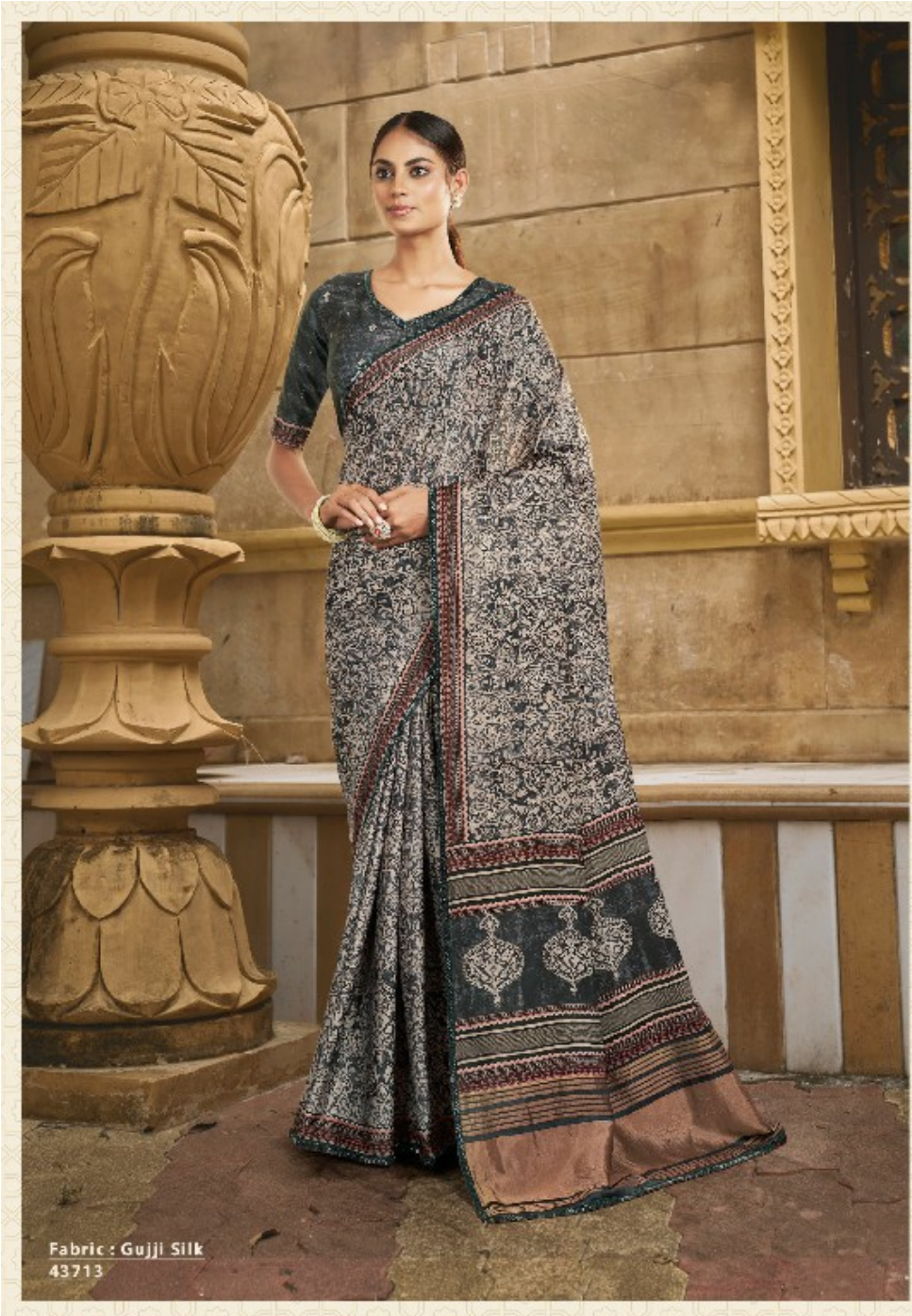
Fabric : Gujji Silk 43713