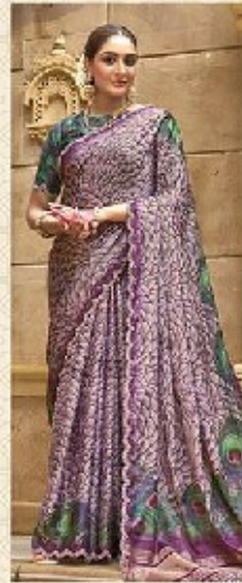
43712 Fabric - Gajji Silk