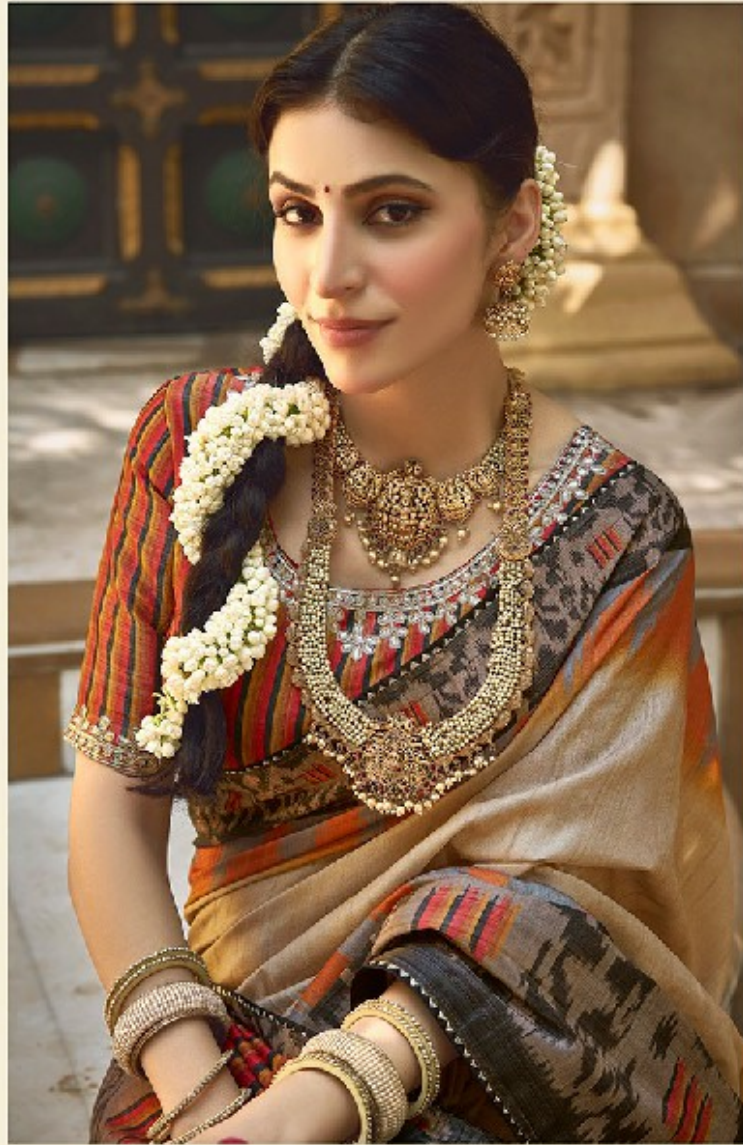
Reflecting beauty and grace in every look.