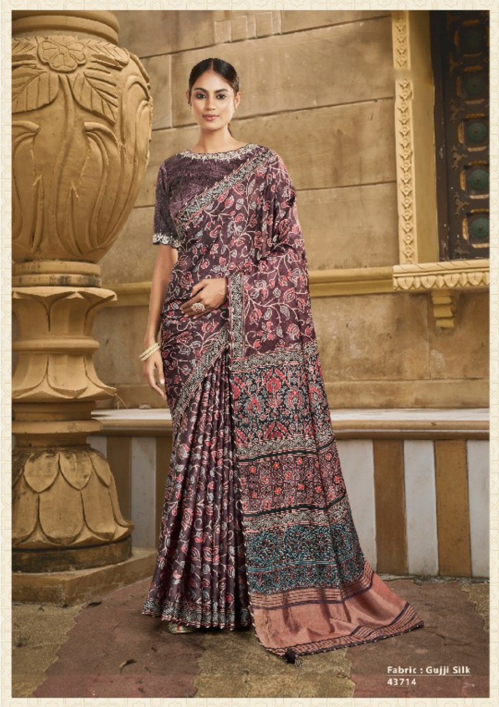
Fabric : Gujji Silk 43714