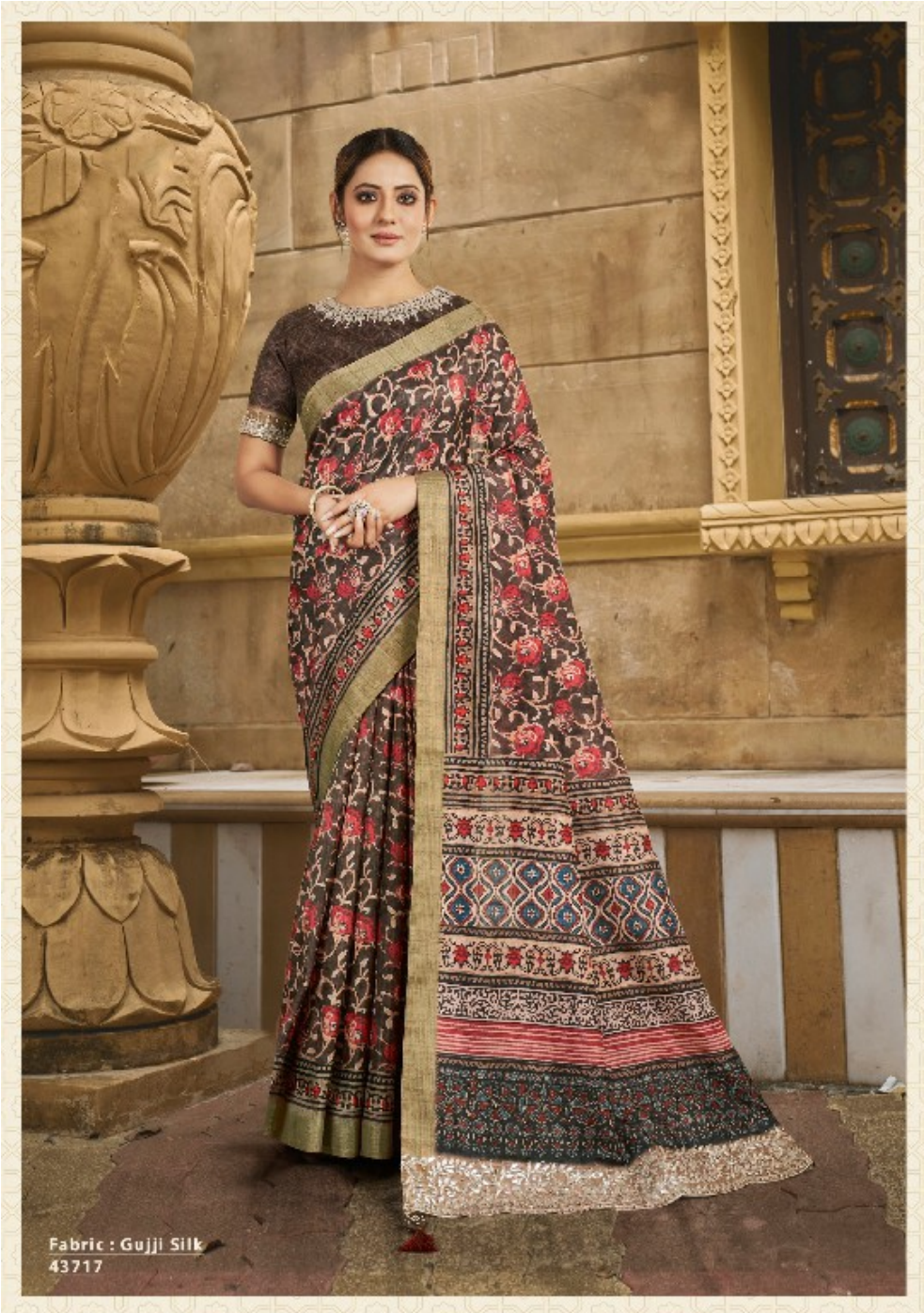
Fabric : Gujji Silk 43717