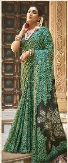
43708 Fabric - Gajji Silk