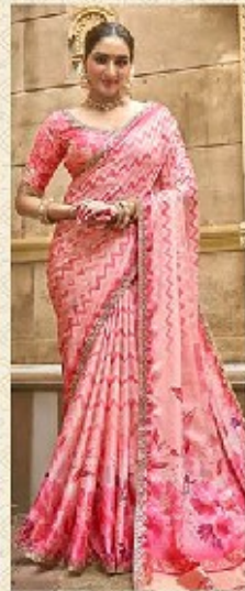
43711 Fabric - Gajji Silk