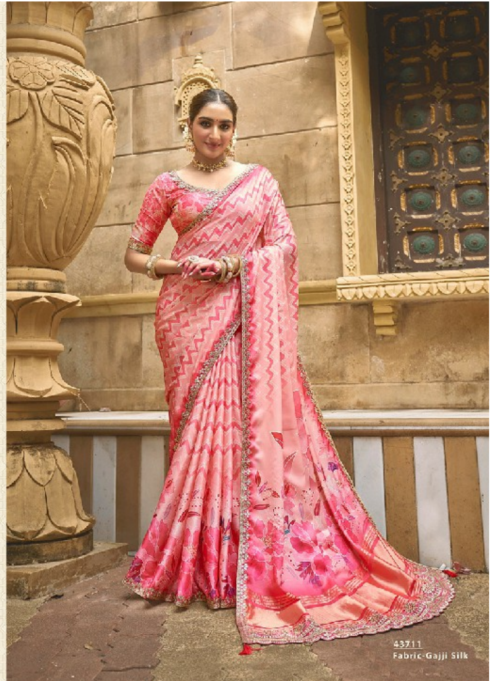
43711 Fabric-Gajji Silk