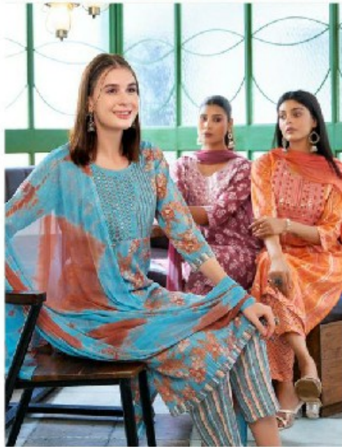
Embroidered Kurta, Designer Kurta, Printed Kurta, Cotton Kurtas, Leitha Kurta, Georgette Kurta, Long Kurta, Short Kurta, Traditional Kurta, Ethnic Kurtis and Fashion Kurtis are the various options Kurta.