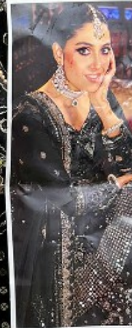
CHANTELLE Vol. 11 TOP Embroidery, sequins, beads OTTOMI-PAJAMA Embroidery, sequins, beads PAJAMA Embroidery, sequins, beads