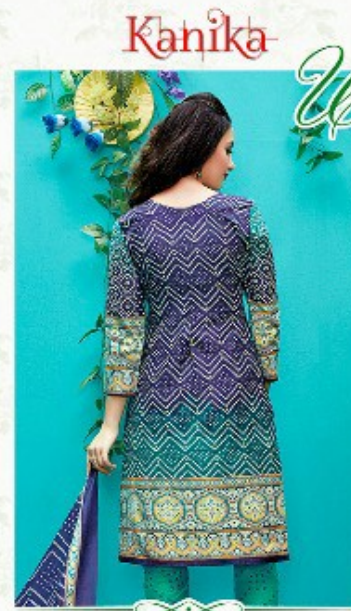
The fashion of the world is to avoid cost, and you encounter it.....