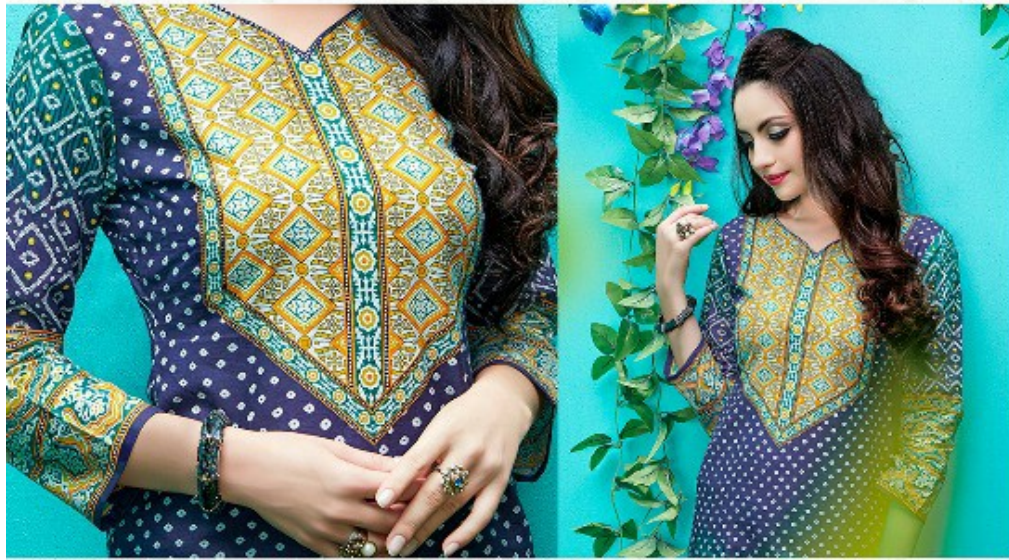
The colors of the design - the harmony, rhythm, and balance are all the same with color and fashion design . . . .