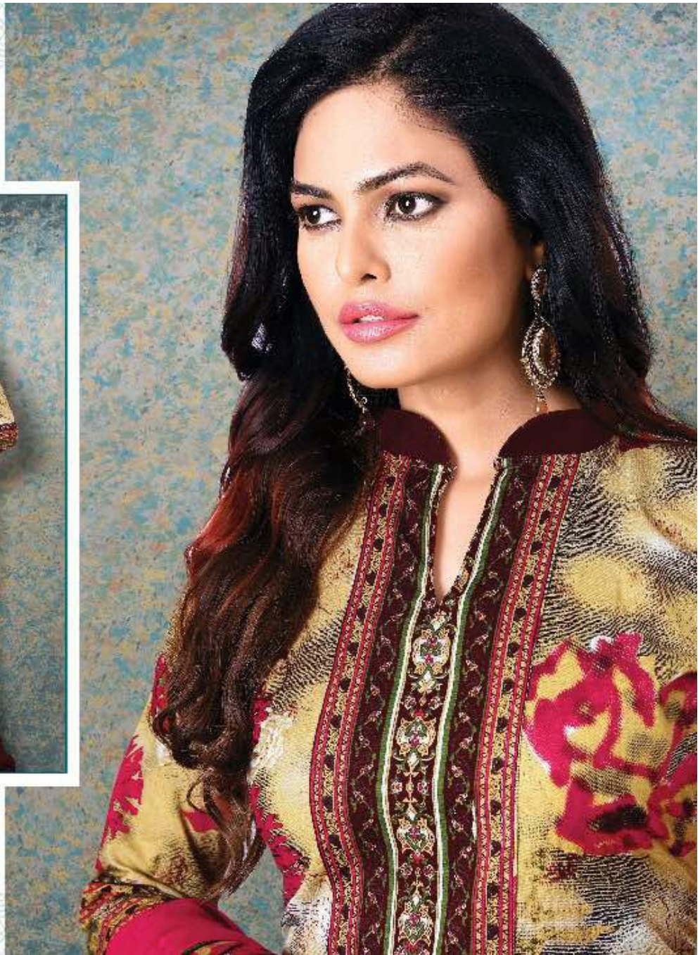
❦ D. No. 1005