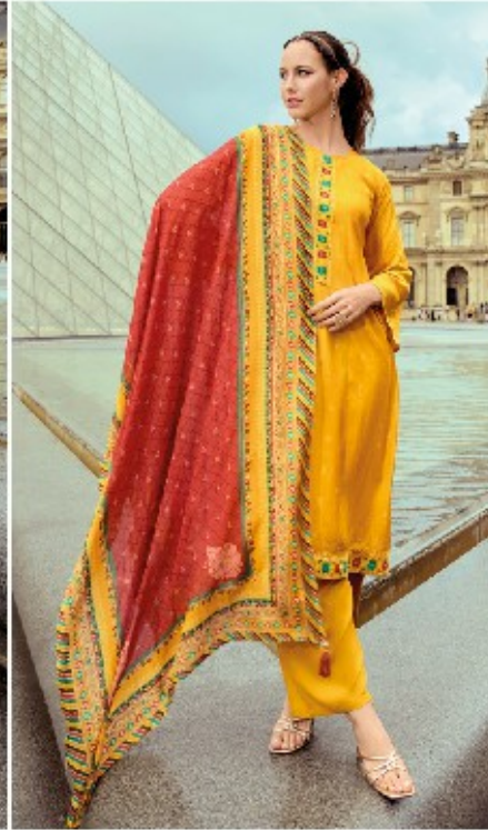
JASMINE : 02