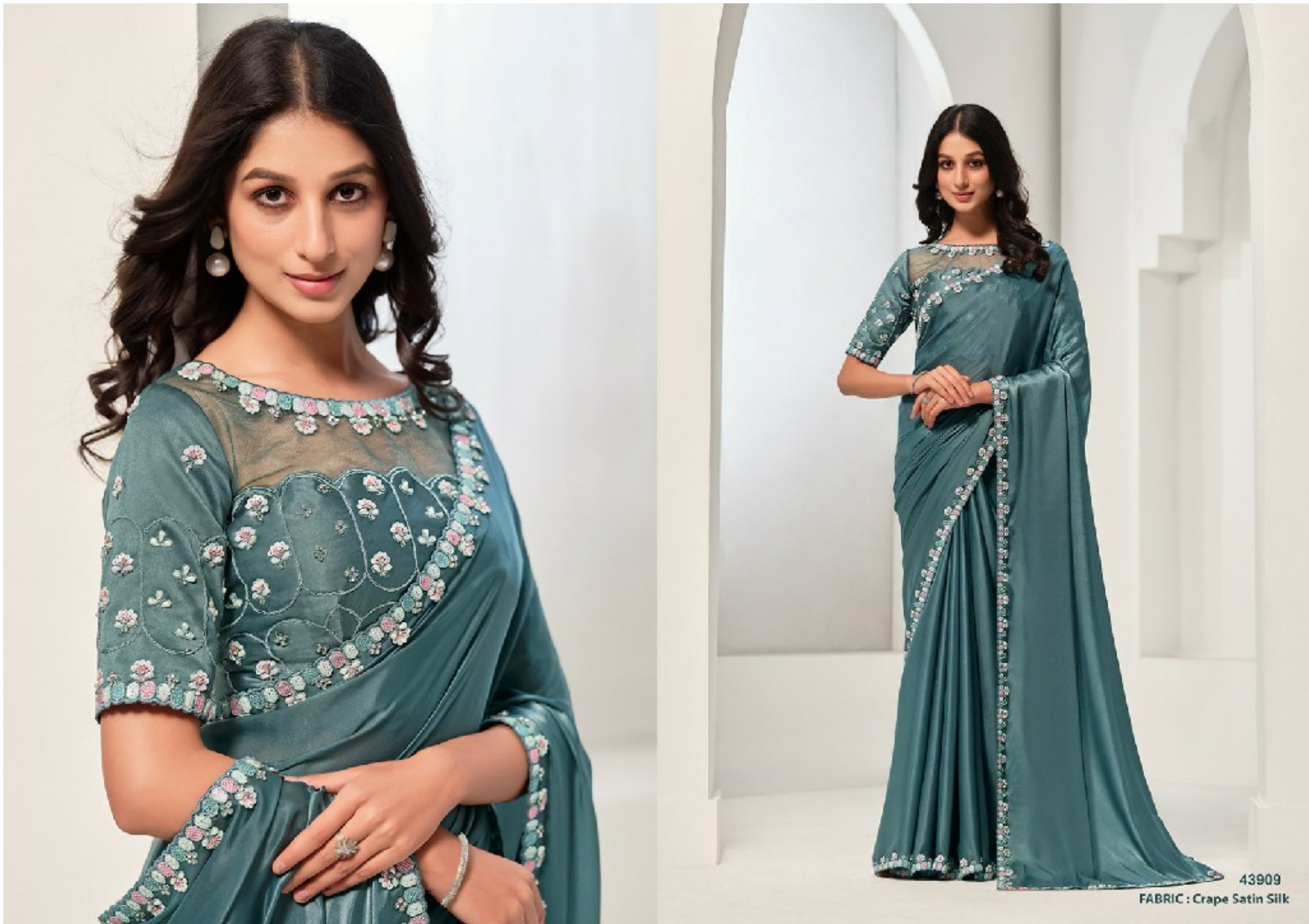
43909 FABRIC : Crape Satin Silk