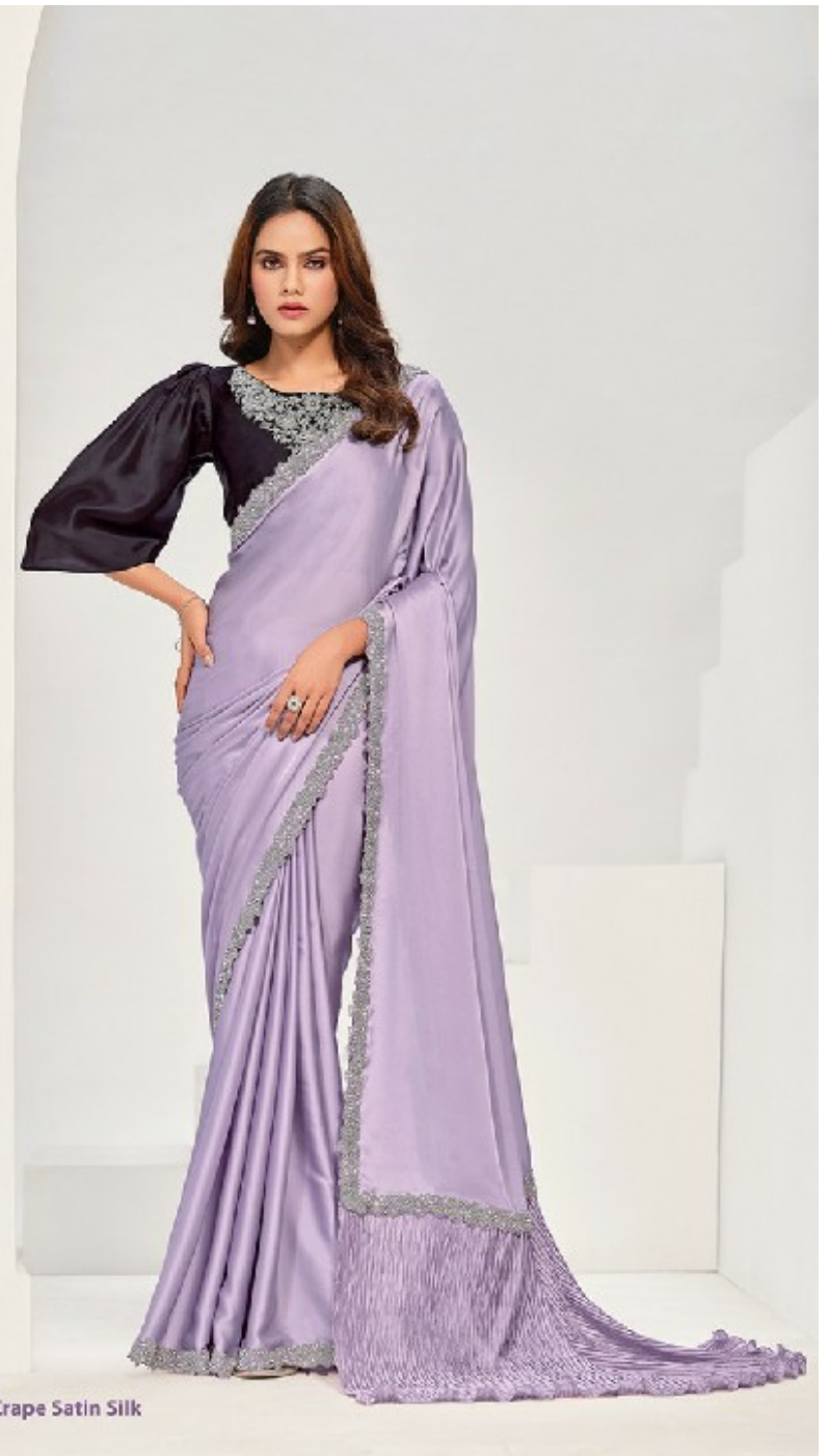
43910 FABRIC : Grape Satin Silk