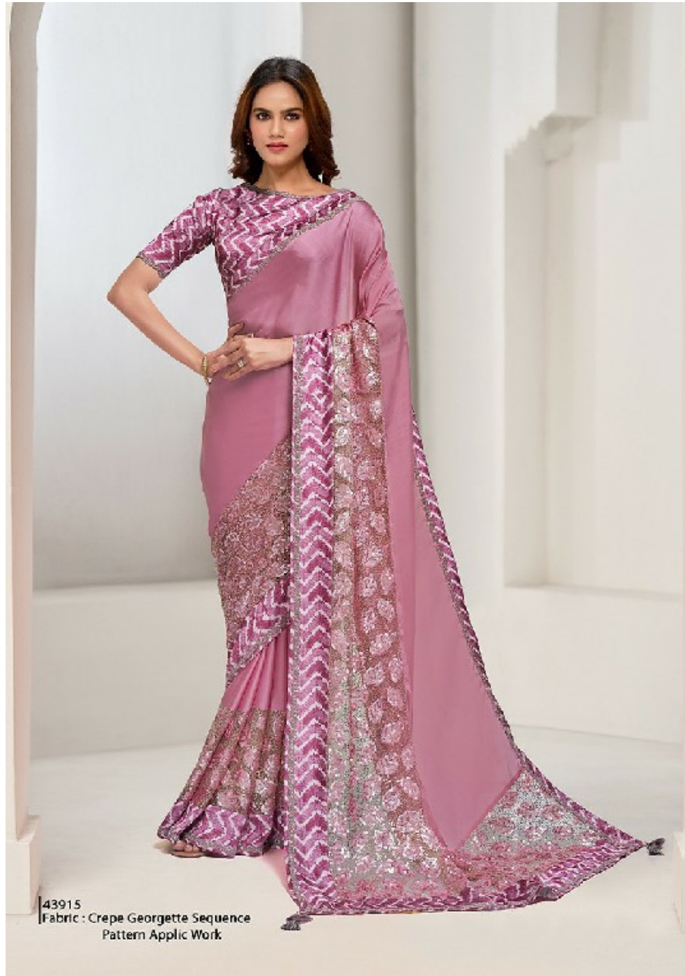
43915 Fabric : Crepe Georgette Sequence Pattern Applique Work