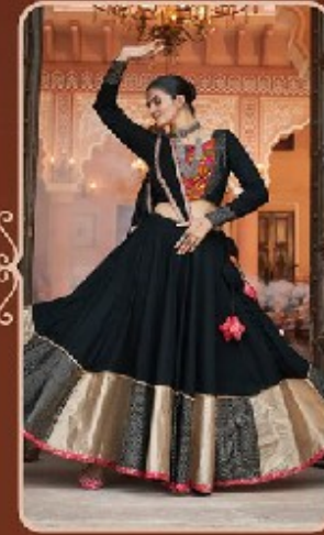
RASS - 2434