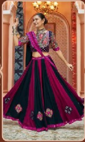
RASS - 2431