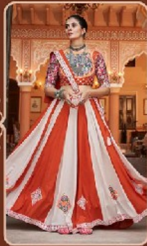
RASS - 2436