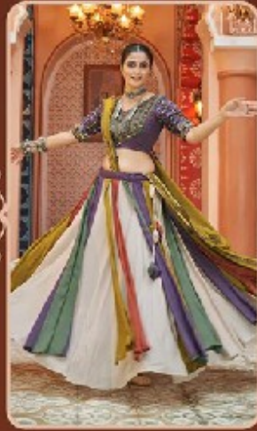
RASS - 2432