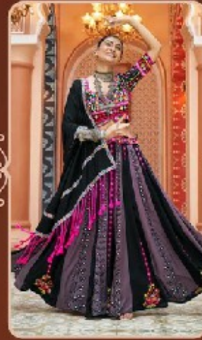
RASS - 2433