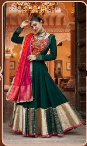
RASS - 2435