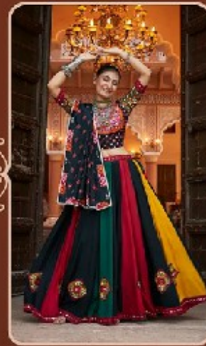
RASS - 2437