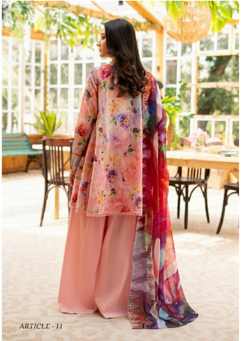
ARTICLE - 11