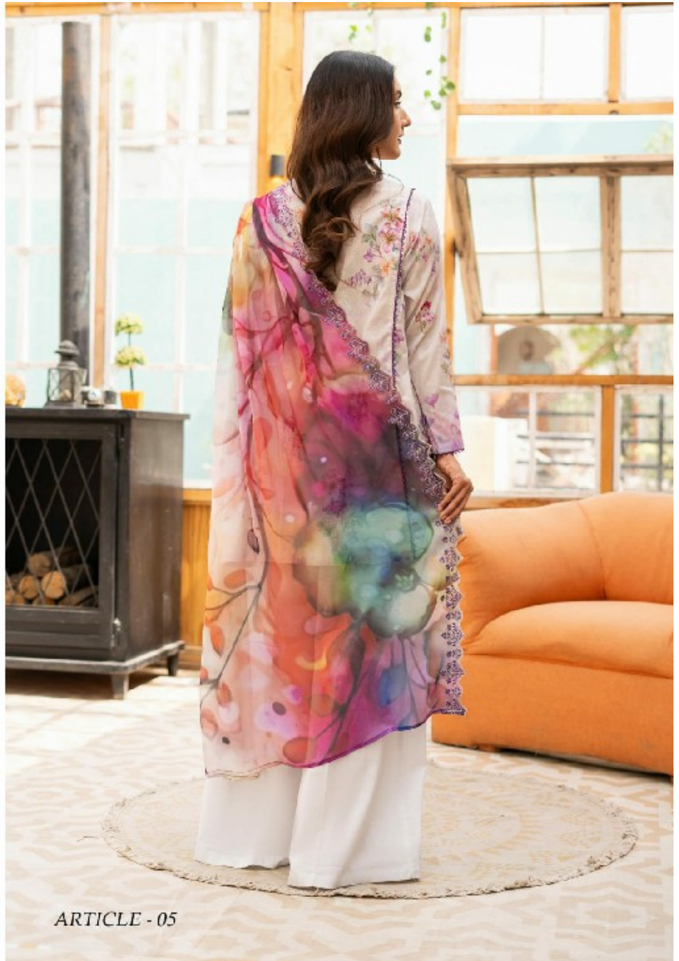
ARTICLE - 05