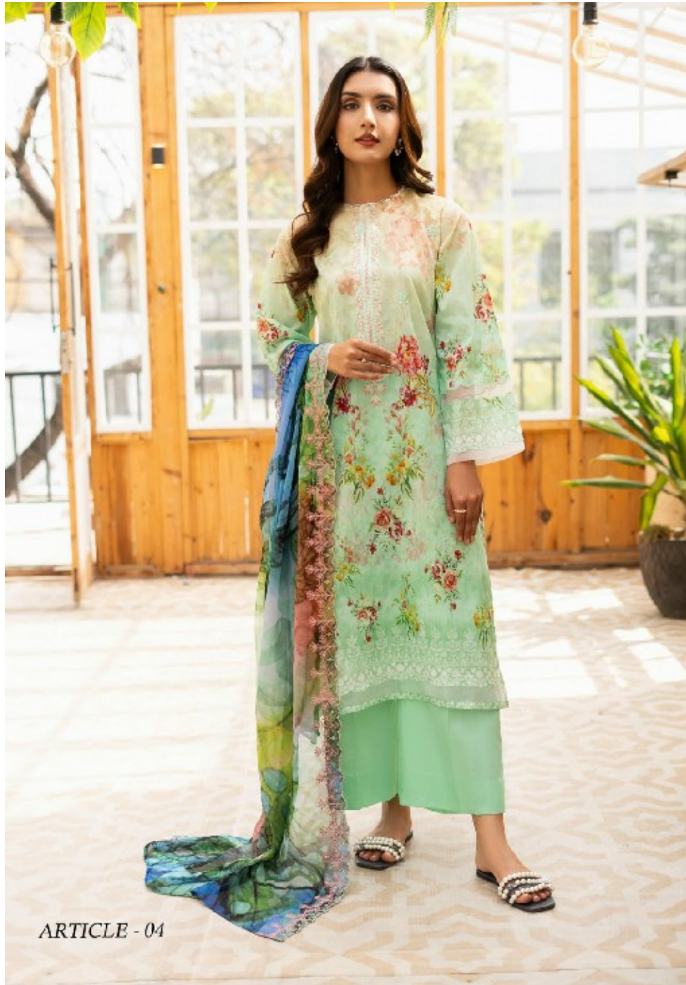
ARTICLE - 04