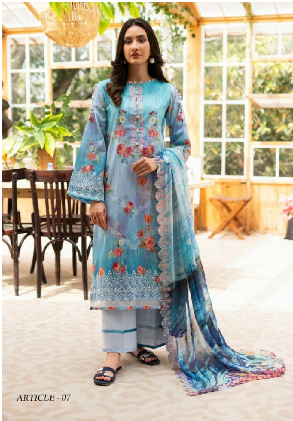
ARTICLE - 07