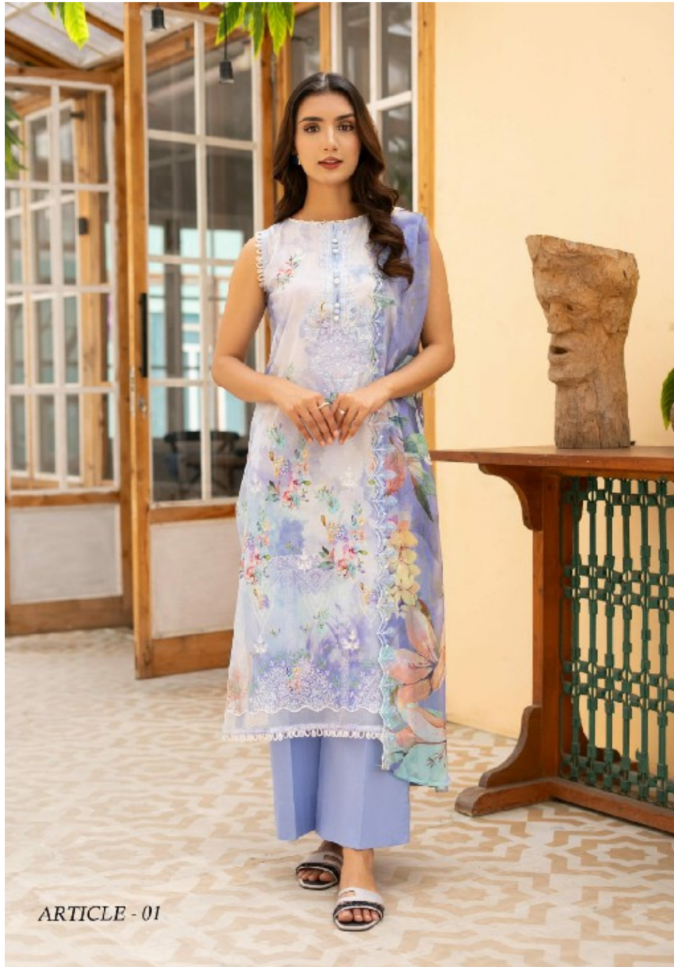
ARTICLE - 01