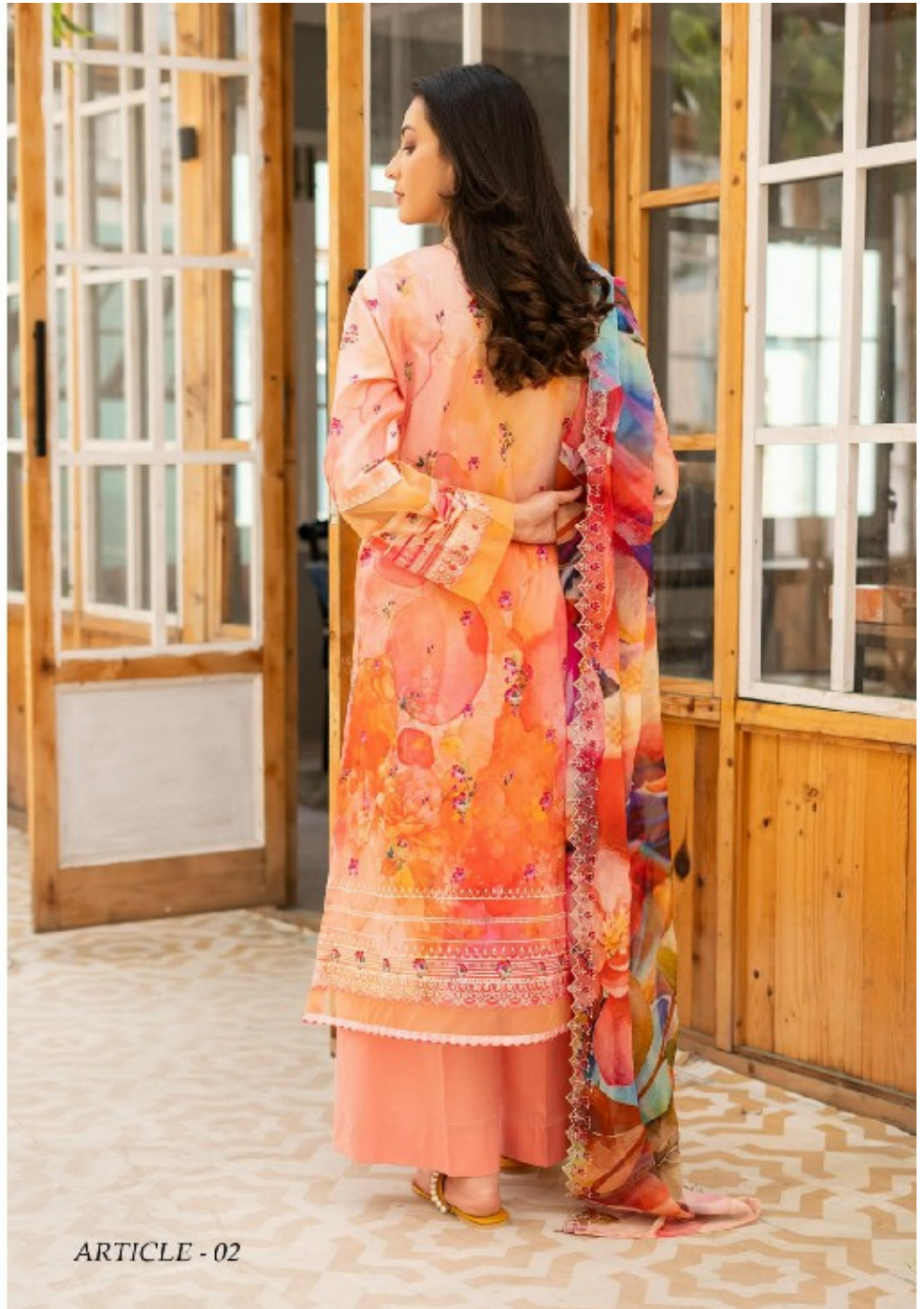
ARTICLE - 02