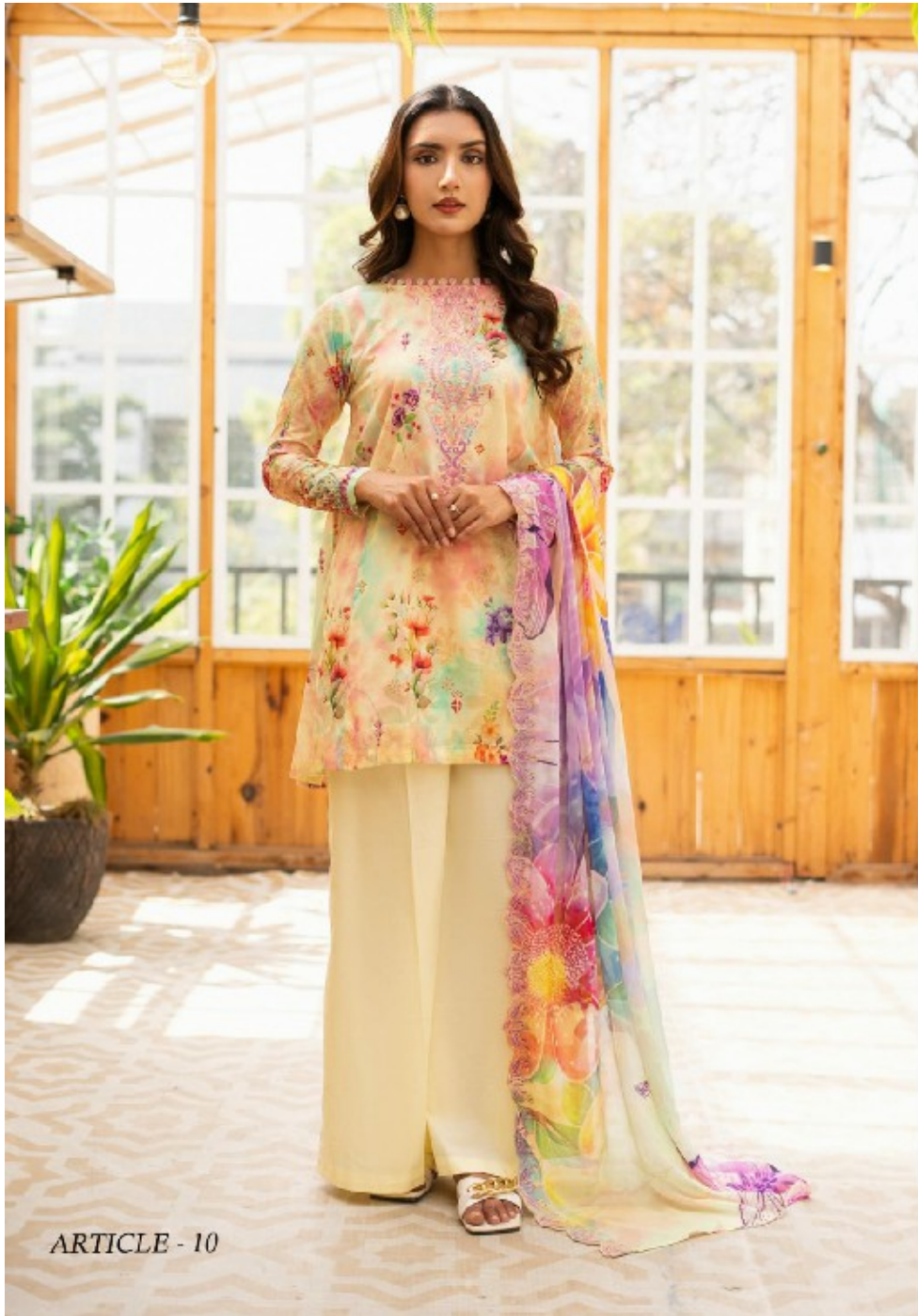
ARTICLE - 10