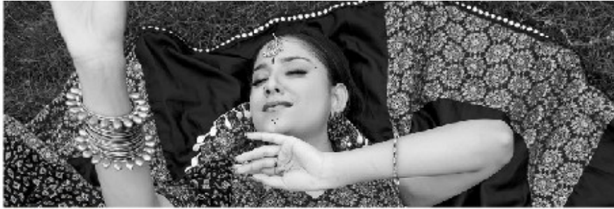
Classic style with Inexpensive and fabrics