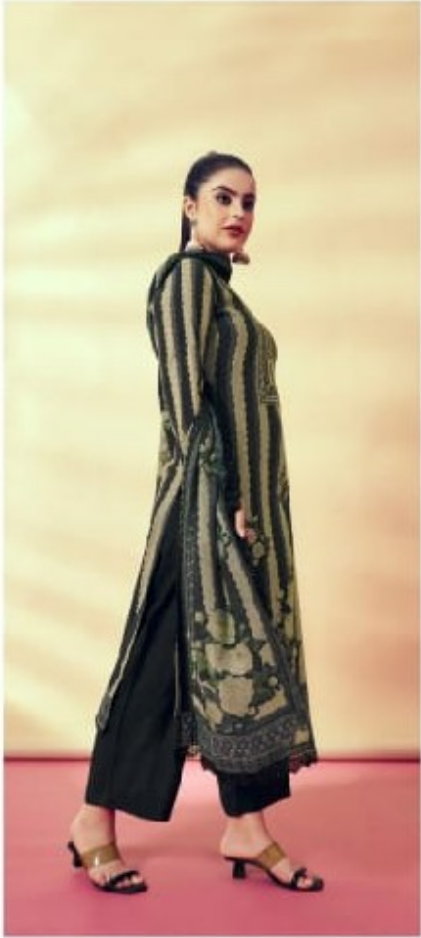
| ELEGANT EMBROIDERED CONTRAST ENSEMBLE |