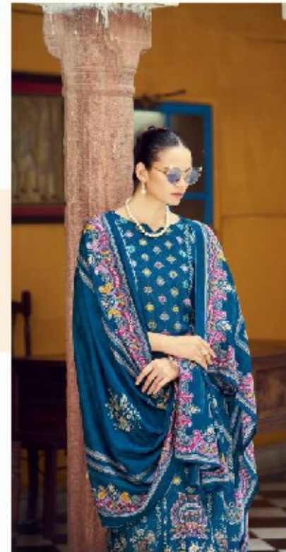
A BIRD OF FEATHERS ARRAYS BY DIVYATI MEHRA & USHI LAKHOSIA INSPIRED BY INDIAN CULTURE