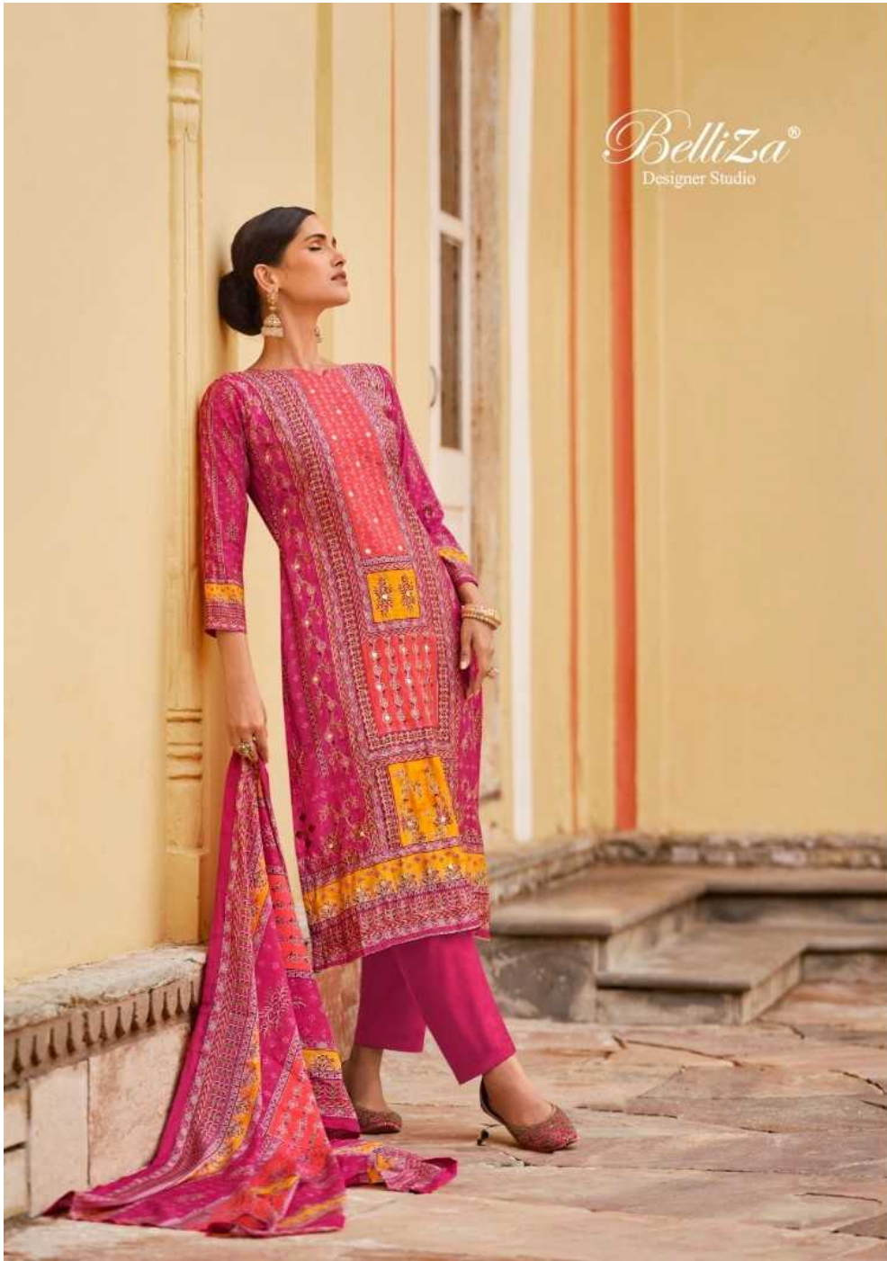
Allow an assortment of vibrant medallions, paisleys and geometric trics to crowd your wardrobe