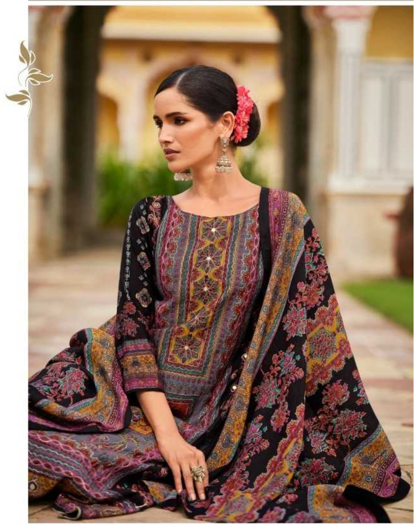
Being your stunning best to match the elegance occasion. Your stunning side this season.