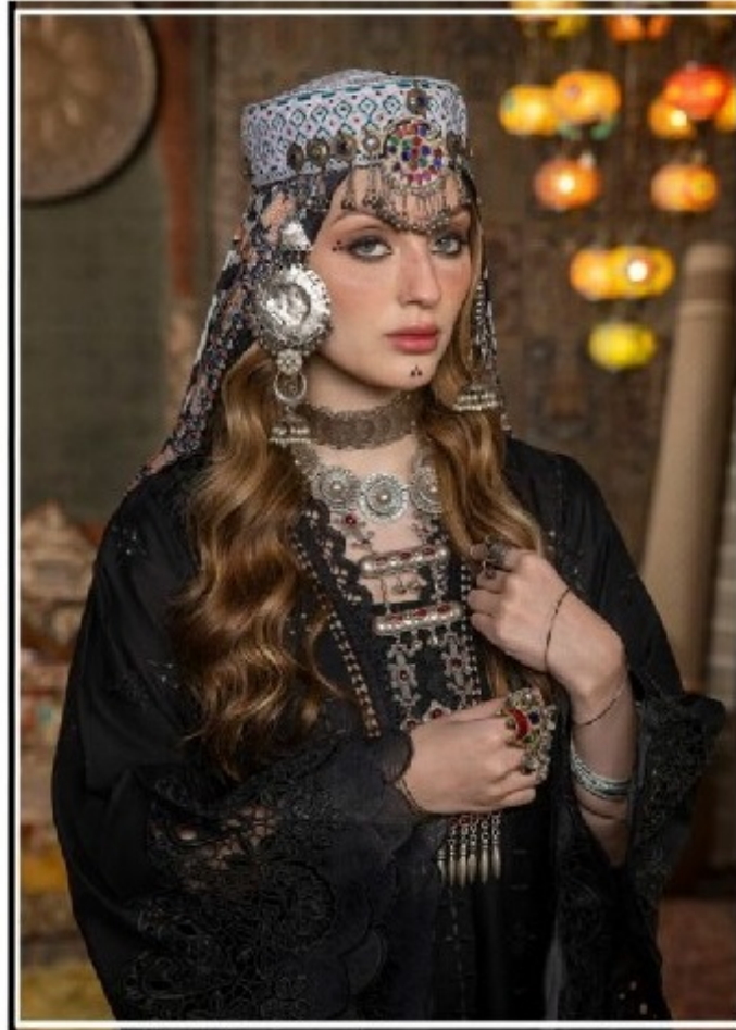
ADAN LIBAS CHIKANKARI - 28