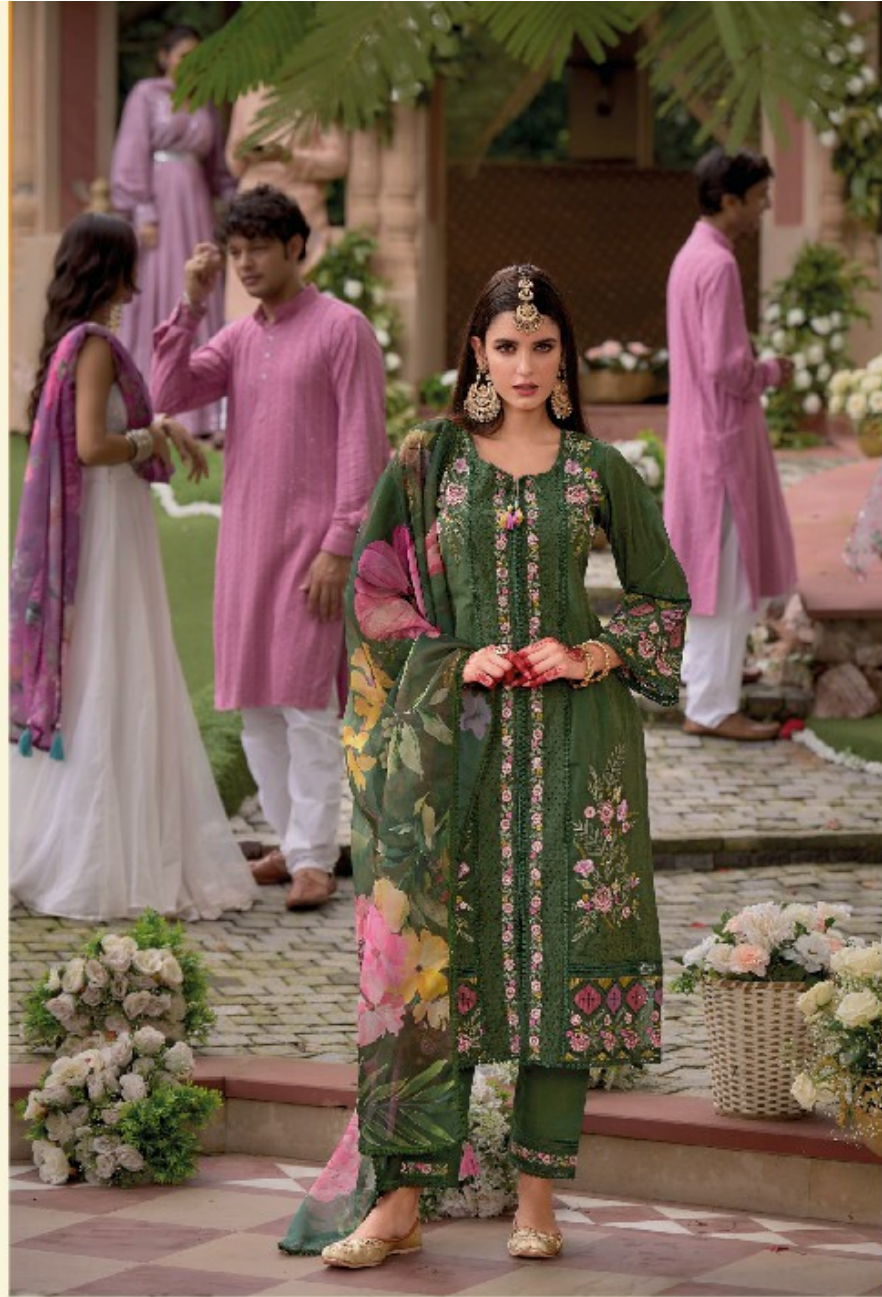
42752 The best color in the whole world is the one that looks good on you