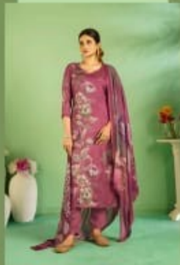
Gulnaaz 7037 D