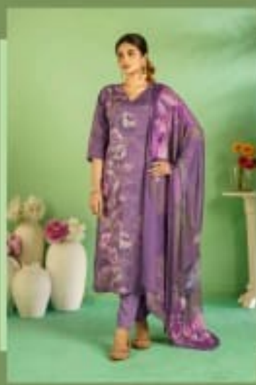
Gulnaaz 7037 B