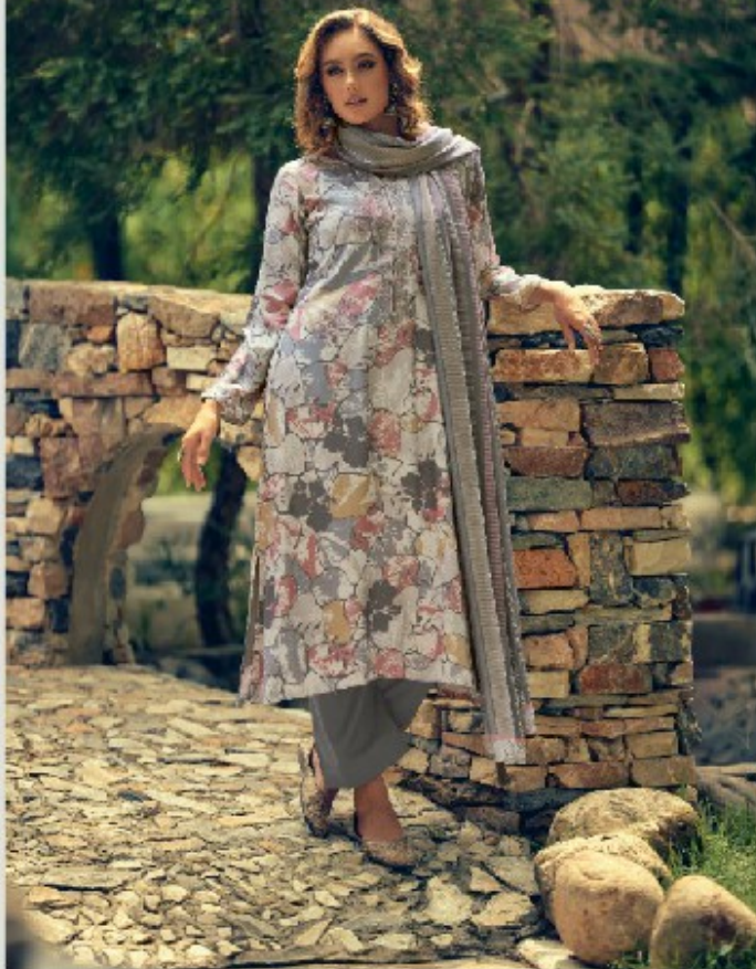
The new age style calls for a change in trend. Ditch heavy embroidery for delicate embellishments on the lighter-than-air dress.