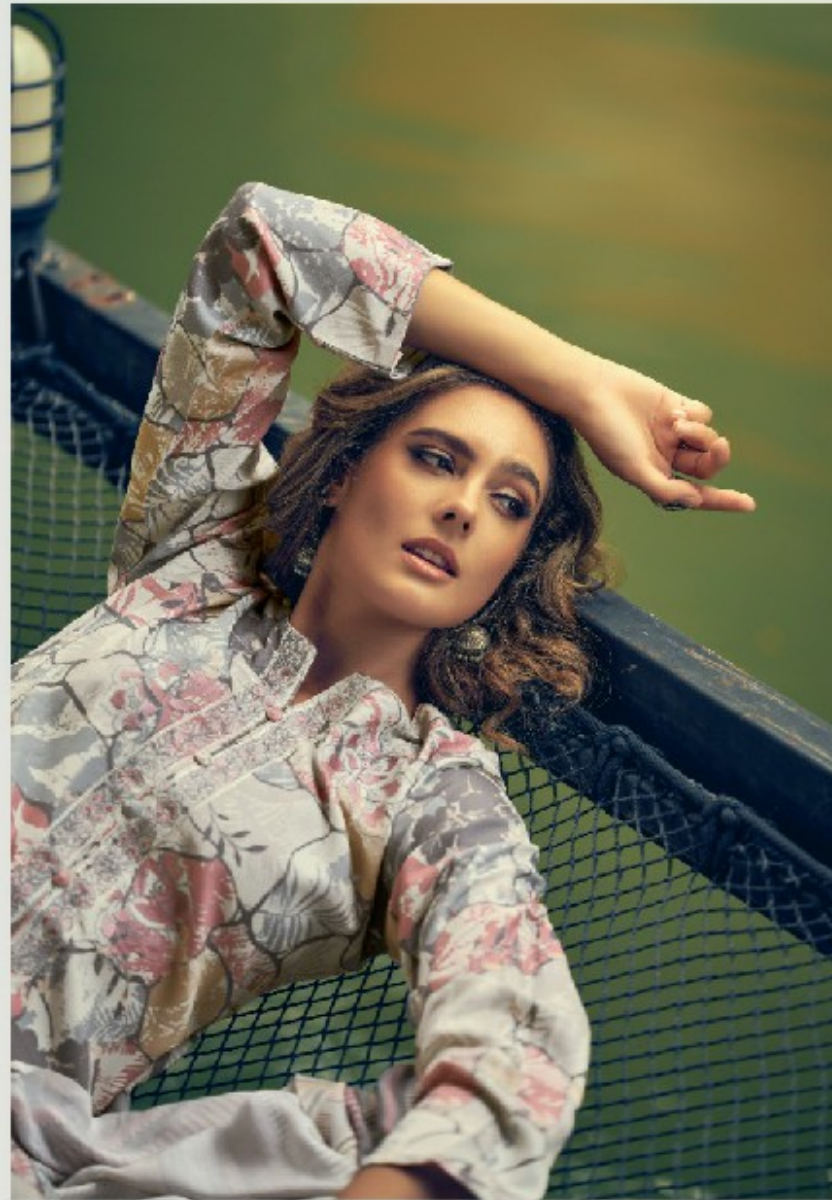
The new eye style calls for a change in trend. Ditch heavy embroidery for delicate embellishments on the fall-to-shoulder dress.