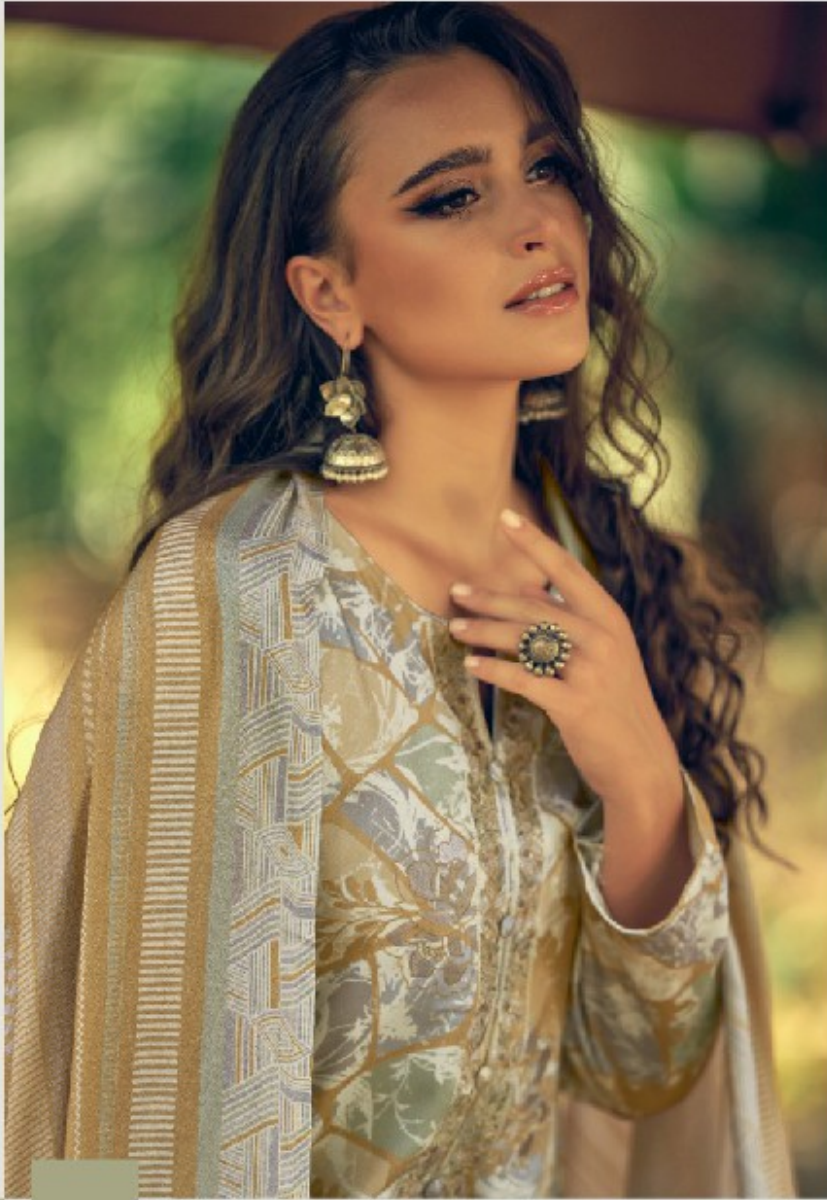
Inject some high octane glamor into your wardrobe with this royal embellished dress.