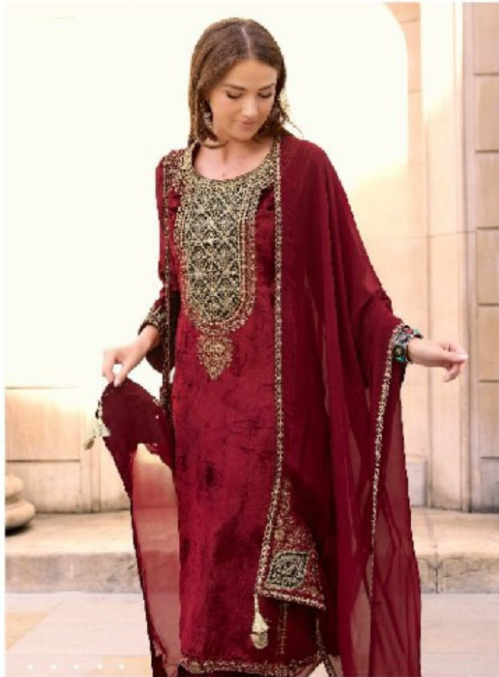
Everyday designs are created keeping in mind the need for fabric and value of the clothes by fashion designers and manufacturers who try to use the best and durable fabrics available in the market. These days, the fabric used for the dresses is not a normal one. It is made of special materials like silk, cashmere, wool, and even a little bit of leather. The fabric is also treated with different dyes to give it a unique look and feel. The fabric is also treated with different dyes to give it a unique look and feel.