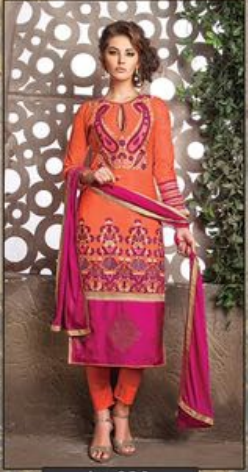
L - 829