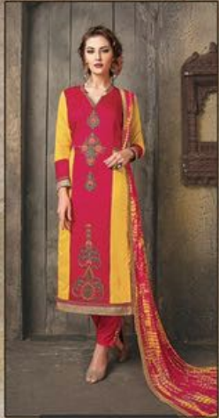
L - 824