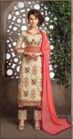
L - 828