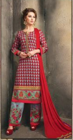
L - 826