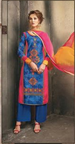
L - 827