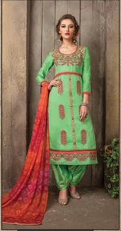
L - 825