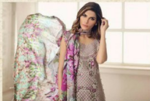
D2 Lavender Treasury