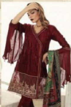
D5 Royale Scarlet