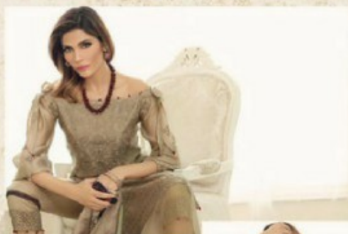
D3 Majestic Craft