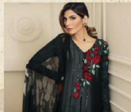
D8 Evening Shadow