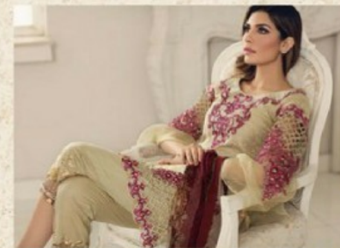
D7 vineyard Glore