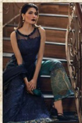
D4 Persian Myth