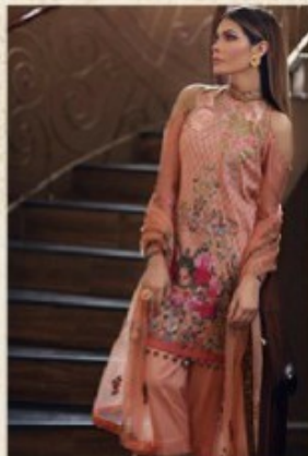
D1 Peach Me Up