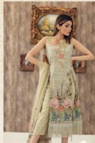
D6 Gold Craving