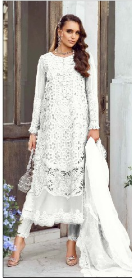
S - 344 B