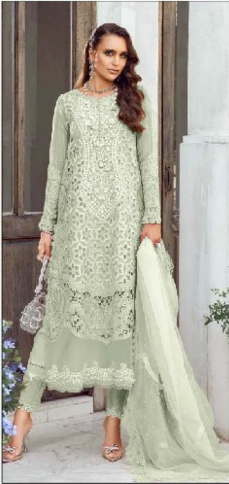
S - 344 A

Dupatta - fox Georgette havi embroidery work