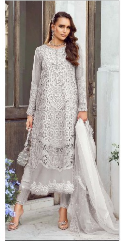
S - 344 D