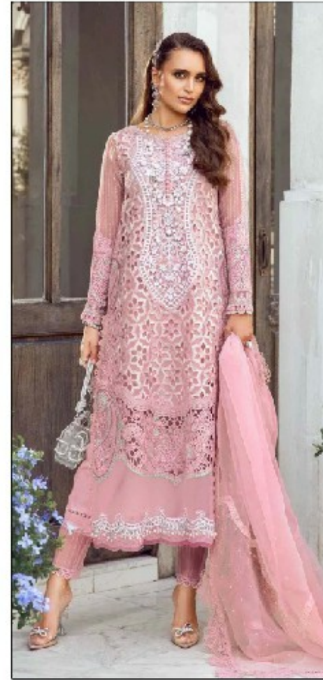
S - 344 C