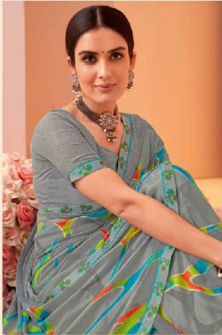
WRITE THE ROYAL STATEMENT ON THE WALL OF FABRICA.