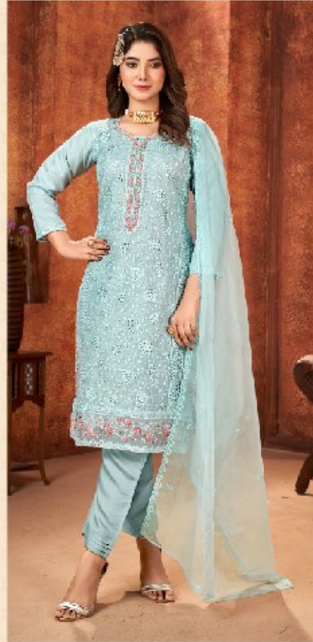
S - 238 B