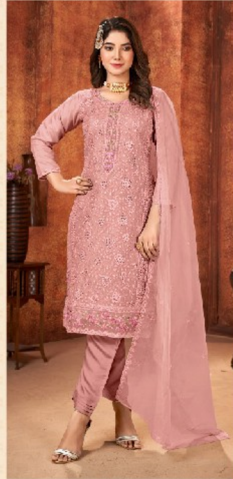
S - 238 C