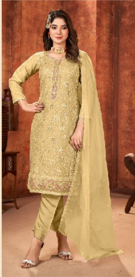
S - 238 A