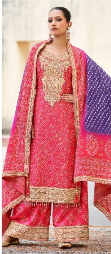
SHRINGAR | 3021