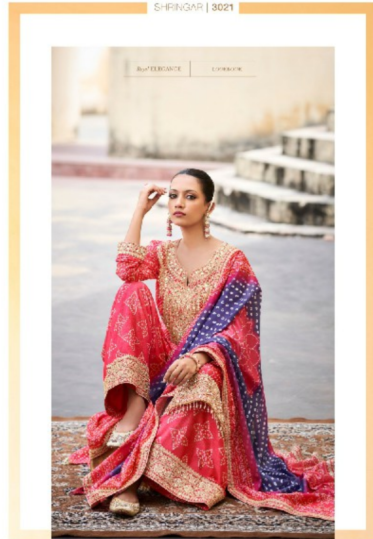
Crafted with the basic design and AMAZING COLOR combination, THIS COLLECTION will make you fall for it.