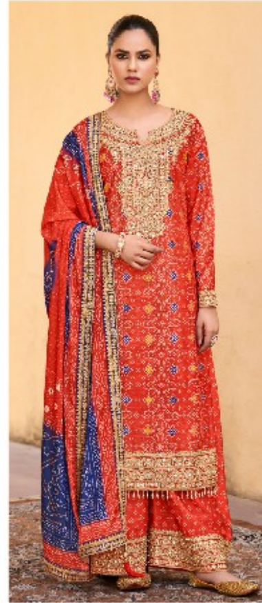
SHRINGAR | 3023