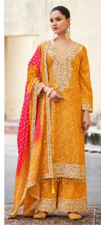
SHRINGAR | 3024