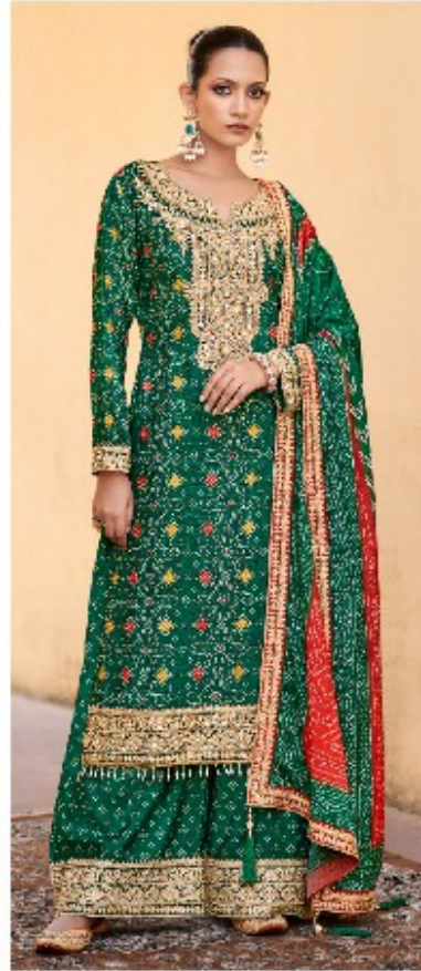
SHRINGAR | 3022